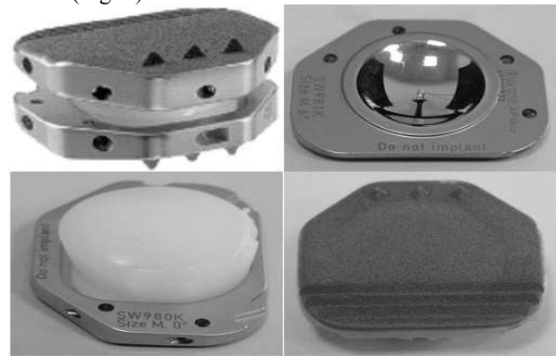
Figure 1: B.Braun Spine disc - Active-L spinal disc prosthesis (Top Left), Upper or Superior end-plate (Top Right), Lower or Inferior end-plate with UHMWPE inlay material (Bottom Left) and Outer side of end-plates with anchor studs and porous titanium & Calcium phosphate layer for enhancing osseous induction process (Bottom Right) (B.Braun Inc., 2010).

A commercial, L4/L5 (Lumbar 4 and 5 vertebrae) Activ-L™ artificial spinal disc prosthesis (Aesculap, B-Braun, Germany), was selected as a base for the development of the load cell (Fig. 1).