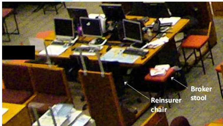
Image 7. A box on the trading floor

The interaction between reinsurers and brokers occur every day and are transacted in face-to-face interaction. The routinized activities take place at standardised desks (called "boxes") comprising the trading floor. These desks are organized in a rectangular, compact configuration (see Image 7). These interactions typically take between 2 to 30 minutes, usually around 15 minutes. They are intense, time-constrained interactions which establish the basis for, and shape the outcome of a reinsurer's decision to allocate capital to any particular deal.