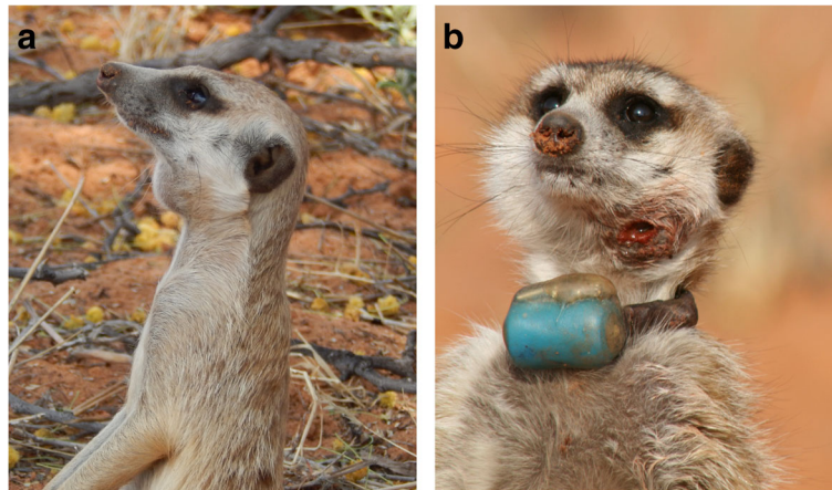
Fig. 1 Meerkats with pathology typical of tuberculosis caused by Mycobacterium suricattae . a A meerkat displaying swelling of the submandibular lymph node. These lesions typically present at post mortem as granulomatous hyperplasia. b A meerkat with a draining sinus tract following necrosis and abscessation of the submandibular lymph node

interferon-gamma (IFN- \gamma ) in response to mycobacterial antigens [6, 7]. Moreover, an alternative diagnostic marker of CMI, IFN- \gamma -inducible protein 10 (IP-10), has been shown to improve diagnostic sensitivity in humans and buffaloes ( Syncerus caffer ) [8, 9]. The specificity of such assays can be optimised by using highly specific antigens such as 6 kDa early secretory antigenic target (ESAT-6) and 10 kDa culture filtrate protein (CFP-10) [10, 11]. However, the genes encoding these proteins have been deleted from M. suricattae and they are therefore unlikely to be suitable diagnostic antigens for this pathogen [2]. As an alternative, the commercially available Bovigam ® PC-HP peptide pool, which contains ESAT-6 and CFP-10 peptides, includes antigens derived from the gene Rv3615c and an additional 3 genes, and could be useful for the detection of M. suricattae infection [11].