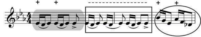
Ill Manors: Verse 2