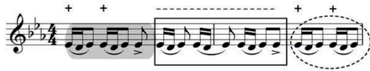
Ill Manors: Verse 1