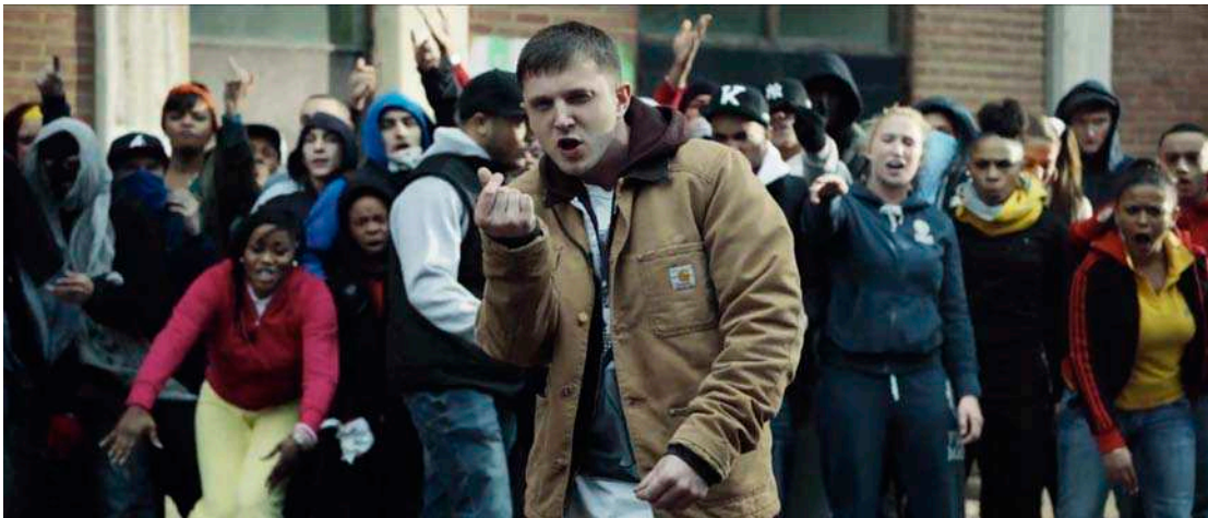
Fig. 1.2. Leader of the Pack

Allan Moore reminds us that “... a musical persona, from whom the protest comes, always exists within a musical environment” (2013: 397). This seems especially relevant to ‘Ill Manors’ where a musical as well as a lyrical analysis reveals how rigorously rhythm and texture are controlled to generate an underlying, simmering tension in the verses that leads inexorably to musical explosions in the