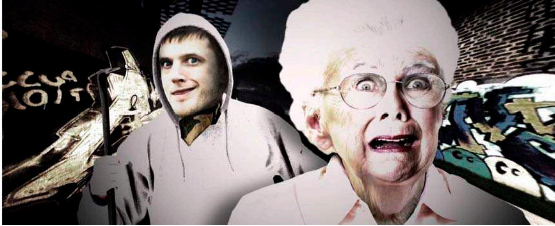
Fig. 1.1. Plan B “Get you bloody tools out”

Keep on believing what you read in the papers Council estate kids, scum of the earth Think you know how life on a council estate is, From everything you've ever read about it or heard Well it's all true, so stay where you're safest There's no need to step foot out the 'burbs