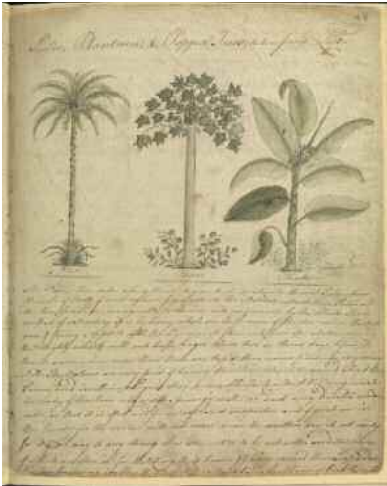
Plate 5. Illustrations of 'Palm, Plantain and Poppa Trees, taken from Life' from the journal of Samuel Gamble, captain of the slave ship Sandown , 1793. L5953.