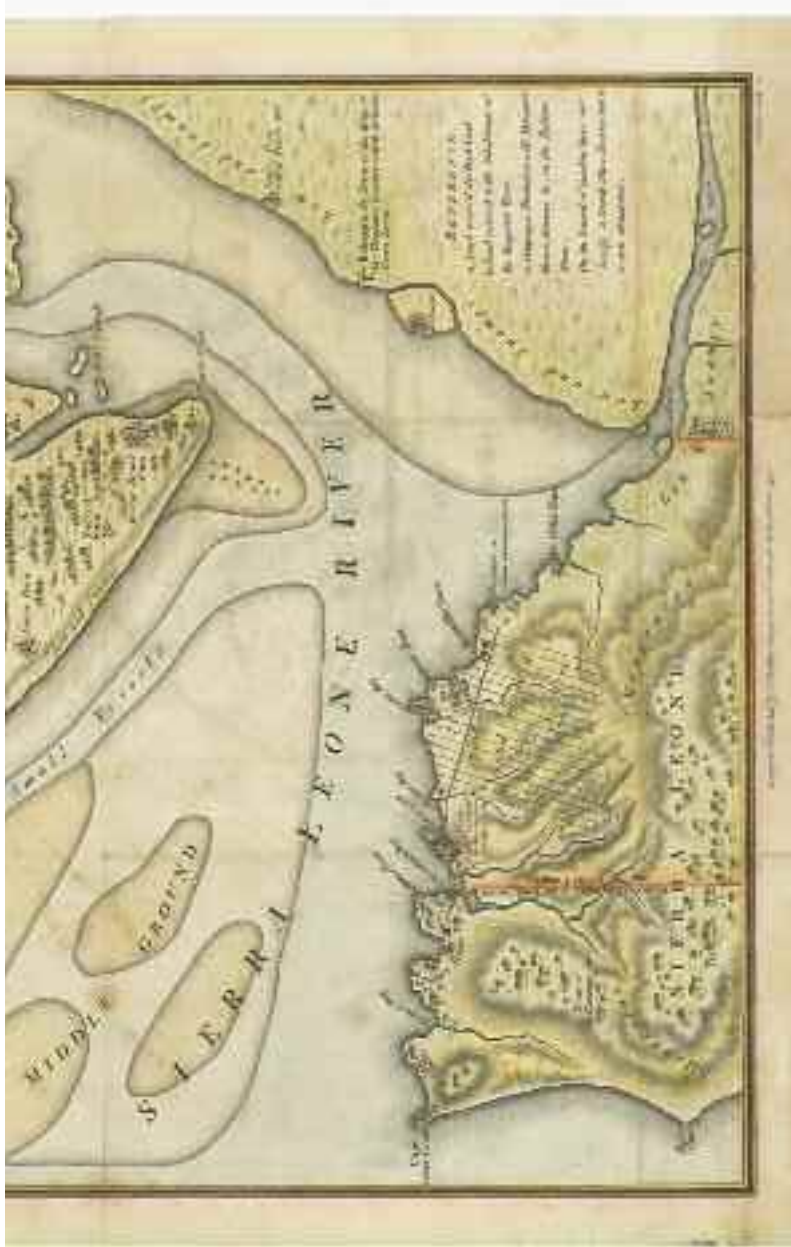
Plate 6. 'Plan of Sierra Leone and the Parts Adjacent, MDCCXCIV'. This plan was published in Substance of the Report Delivered by the Court of Directors of the Sierra Leone Company to the General Court of Proprietors on Thursday the 27 th March, 1794 , London, 1794.