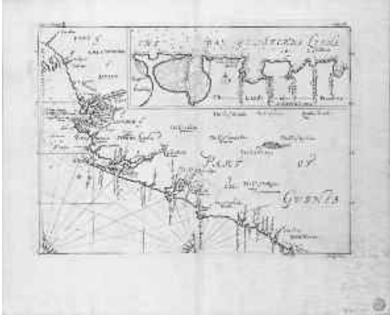
Figure 2. Chart of Part of the Coast of Sierra Leone and Liberia from Los Islands (Guinea) to River Cess (Liberia), J. Kip, 1732. FO418

By the time the abolitionists established their experimental colony in Sierra Leone, there had been over three centuries of Afro-European interactions on the upper Guinea coast based on trade in slaves, provisions and gold. 8 Viewed narrowly from the British abolitionist perspective, Sierra Leone had a new role to play in the late eighteenth century as a model of economic and social reform in West Africa.