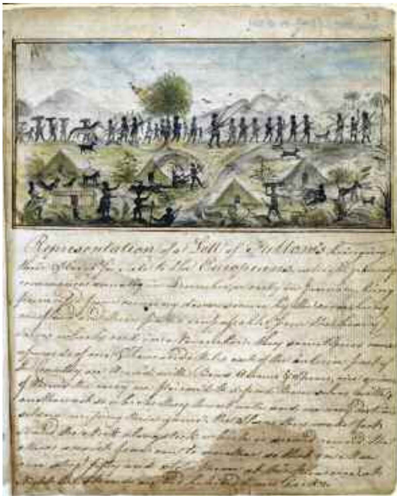
Plate 2. Image of a Slave Caravan from the journal of Samuel Gamble, captain of the slave ship Sandown , 1793. An entry underneath the image refers to 'Representation of a Lott of Fallow's [Fula] bringing their slaves for Sale to the Europeans'. D7596