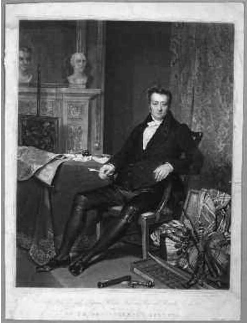
Figure 4. Thomas Clarkson, 1760–1846, circa 1825. FO869 Clarkson is depicted with his specimen chest of African products.