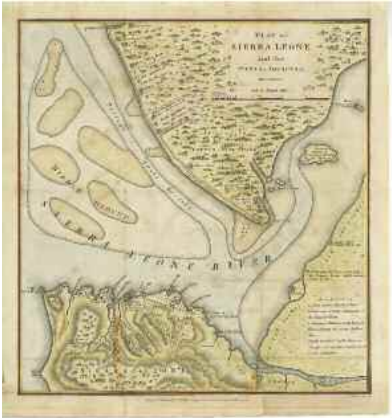
Plate 3. 'Plan of Sierra Leone and Parts Adjacent, MDCCXCIV'. This plan was published in Substance of the Report Delivered by the Court of Directors of the Sierra Leone Company to the General Court of Proprietors on Thursday the 27 th March, 1794 , London, 1794.