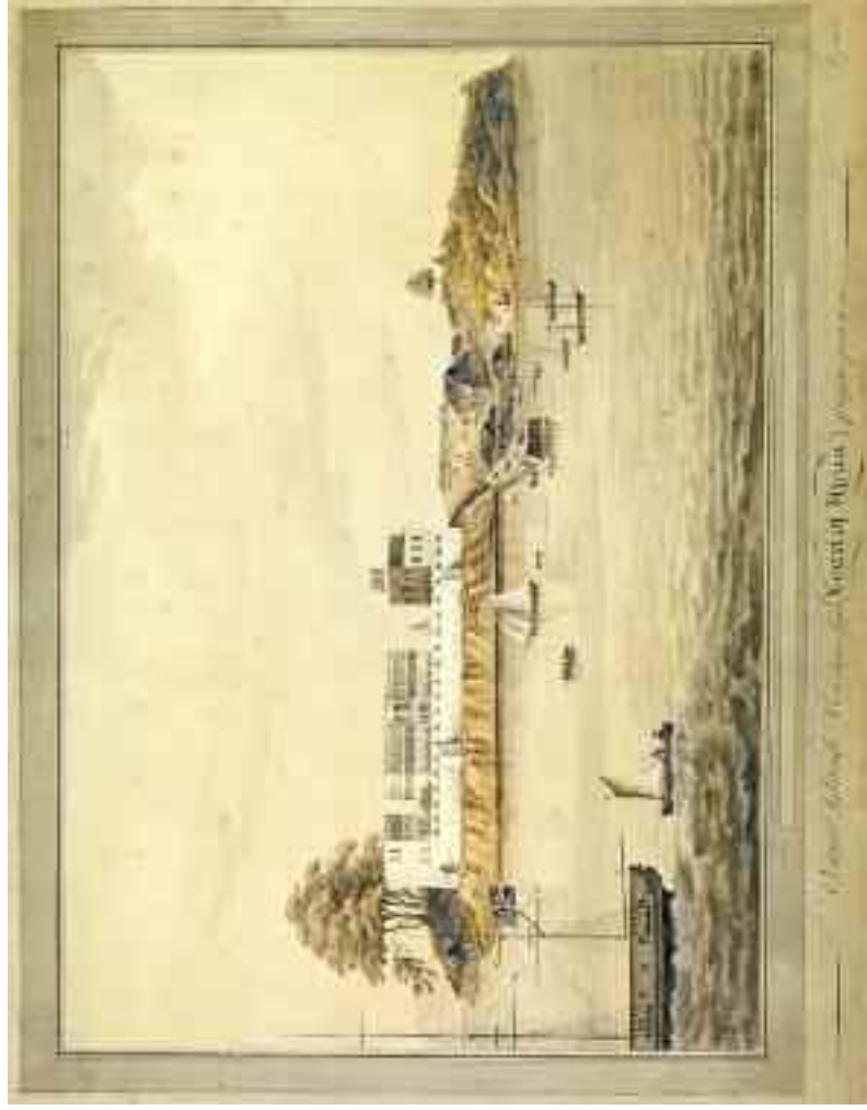
Plate 4. 'Bance Island, River Sierra Leone, Coast of Africa', Joseph Corry, circa 1805. This was 'the original watercolour for the coloured aquatint published in Corry's Observations upon the Windward Coast of Africa , London, 1807'. F5773.