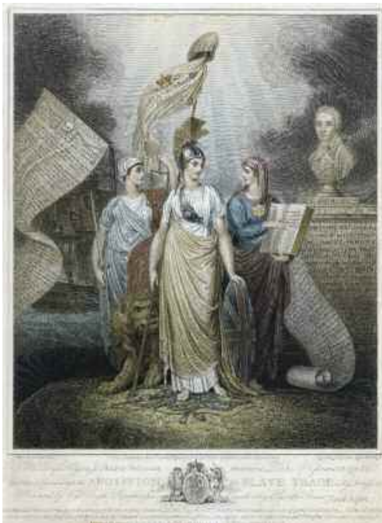
Plate 1. Plate to Commemorate the Abolition of the Slave Trade, 4 June 1808. This hand-coloured etching included a caption which referred to 'Britannia trampling on the emblems of slavery, holding a banner declaring the abolition and attending to the voice of justice and religion'. PY7367