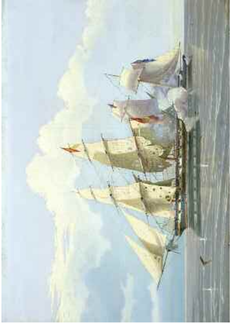
Plate 7. The Capture of the Slaver Formidable by HMS Buzzard , 17 December 1834. William John Huggins. BHC0625