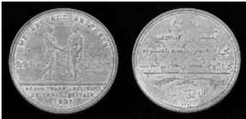
Figure 5. Medal Commemorating the Abolition of the Slave Trade, 1807. The translated inscription states 'Sale of Slaves prohibited in 1807, Christian era, in the reign of George the Third; verily we are all brothers'. FO653-1 and FO653-2.