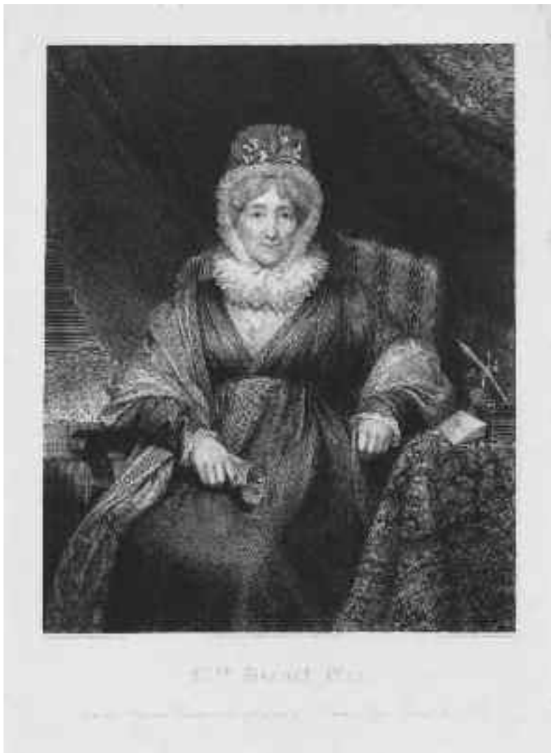
Figure 3. Mrs. Hannah More, 1824. PY6082.