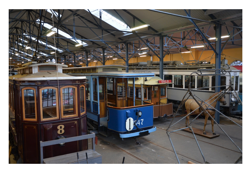
Figure 2: From the exhibition hall at the Oslo Tramway Museum, an institution run entirely by enthusiasts.

enthusiast associations set up and run museums that, at least to the casual visitor, may be hard to distinguish from conventional professional museums. (Figure 3)