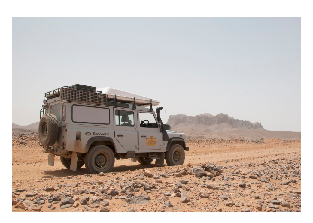
Figure 4: A Land Rover Defender on the overland trail in central Algeria, 2010. This type of experiential knowledge is essential to fully appreciate the phenomenological, social and cultural significance of this design historical artefact.

It should be clear now, then, that individuals and enthusiast groups dedicated to particular aspects of material culture frequently emerge and manifest themselves in a variety of ways; whether it be clubs, individuals collecting particular items they take an interest in, or re-enactors interacting with objects from the past. These interested groups or individuals can hold considerable knowledge and expertise about an artefact and its history—the most characteristic of which is probably what Oddy calls '[the] experiential knowledge of collecting and its methodologies acquired through ownership of the things' (Oddy, 2013).