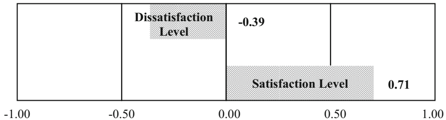
Fig. 3 Dissatisfaction and satisfaction level due to absence or presence of Dynamic Streaming Technology