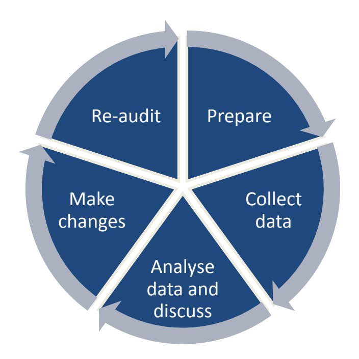
Figure 1: The clinical audit cycle

The clinical audit process is commonly described and depicted as an audit cycle. The general process of audit can roughly be broken down into a five step cycle, as shown in Figure 1. A topic should be chosen to audit and preparations made in relation to the logistics of how the audit will be carried out. Data is then collected and analysed, and a discussion held to decide if and how changes need to be made. Those changes are implemented, and a re-audit run to see what effect they may have had.