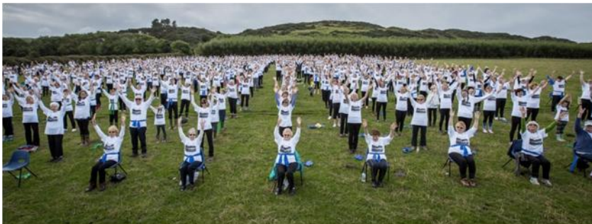
Knockaloe Pilates community event