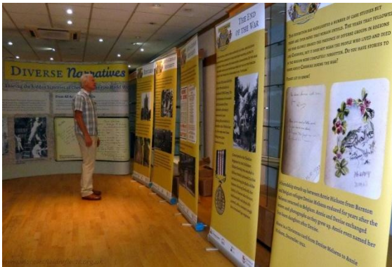
'Diverse Narratives' touring exhibition.

Tata were a major employer of Belgians in the region during the First World War, and are funding two gravestones which will be consecrated in November. The ceremony is expected to be attended by representatives of the Belgium Embassy and other local MPs and dignitaries. The stories of Belgium refugees have also been integrated into a 'Diverse Narratives' touring exhibition, which has appeared in Cheshire public spaces such as market squares and shopping centres. Over 600 people have seen the exhibition and demonstrating the contemporary