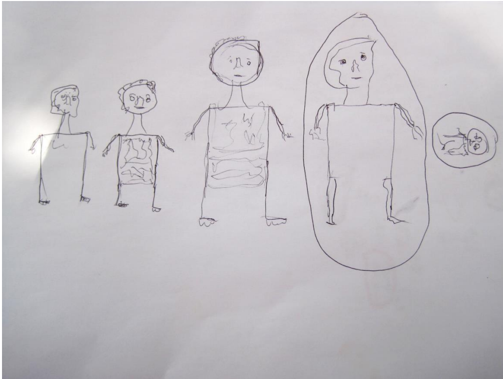
Figure 1: Female Participant's Household Diagram. Ashanti Region, Ghana