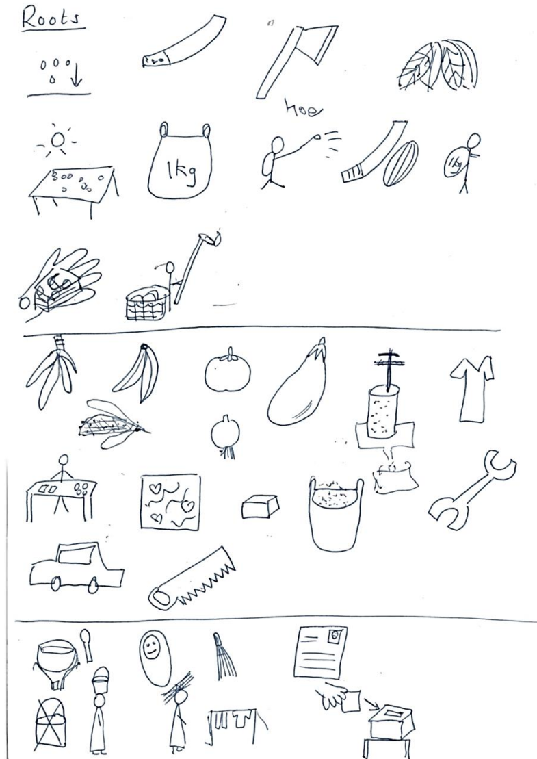
Appendix 3: Example of Symbols Co-created between Researchers and Local Staff.

From top left- to right, symbols represent work including: