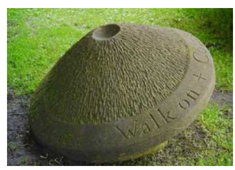
Figure 1 – Image of Companion Stone 'E1' (Longshaw gale location), poet Jo Bell and designer Kate Genever.