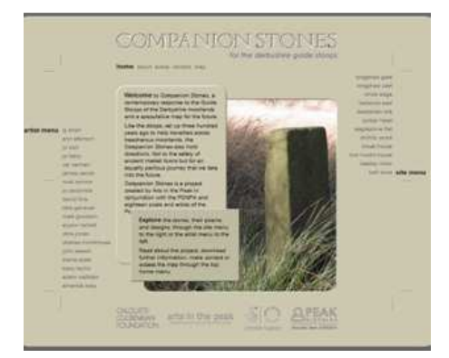
Figure 2 – Companion Stones web page, including inset image of an historic guide stoop http://www.companionstones.org.uk/home/home1.htm [accessed December 2014] *