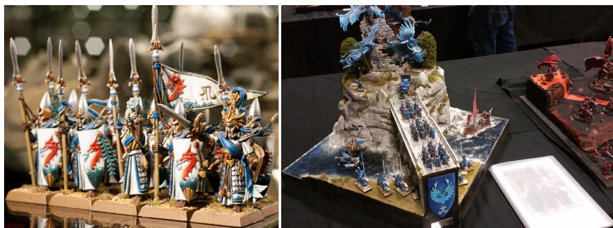
Figure 1 (Left) Typical wargaming miniatures. (Right) Example of an army display board.

Finally, the methods that the hobbyists use to display their collections were also considered. As objects of both creative and competitive practices, the models are more often than not considered as prized possessions that the community strives to present and display. On a community level, the models are often the subject of painting and display competitions, were they are arranged in thematic dioramas that present their army and its achievements in some way, as seen in Figure 1 below.