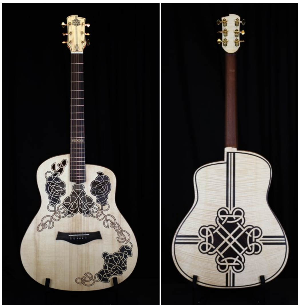
Figure 3: The Carolan guitar

Our second case study involved creating a distinctive travelling technology probe, a digitally augmented 'thing' that could be released into the wild to tour through various settings so as to gather data and engage users in an unfolding design conversation. We chose to digitally augment an acoustic guitar to create an object that would be familiar to many people, valuable, readily portable and that might also gather rich stories through use. We imbued our instrument with a distinct identity in order to establish its uniqueness, naming it 'Carolan' in honour the 18th century Irish harpist and nomadic bard Turlough O'Carolan