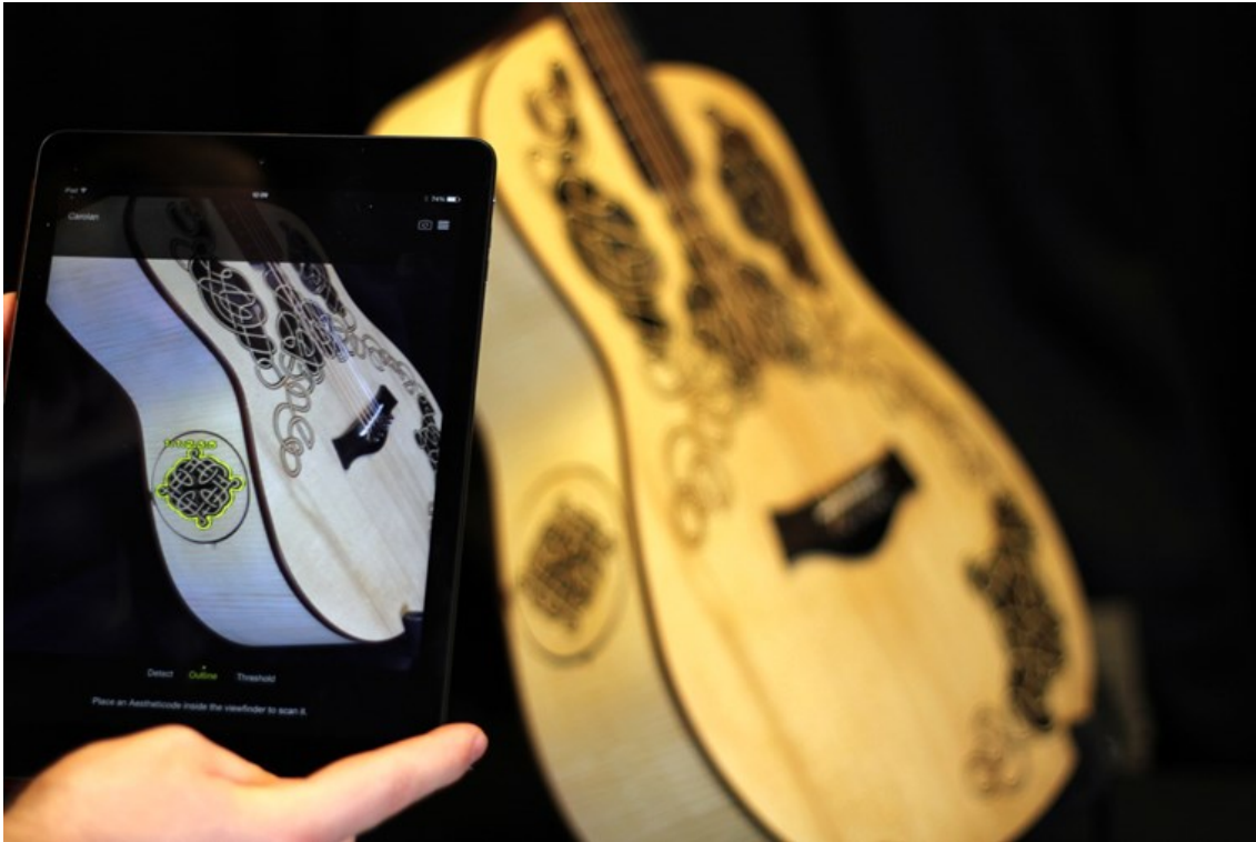
Figure 4: Scanning the Carolan's soundhole

a mobile device to conjure up digital information, in this case media from our guitar's digital record. We then collaborated with a professional luthier (instrument maker) to design and hand-build a bespoke acoustic guitar, including inlaying these six designs into different parts of its body – the headstock, fretboard, front soundboard, back, top and in a small nook at the cutaway – as shown in Figure 4.