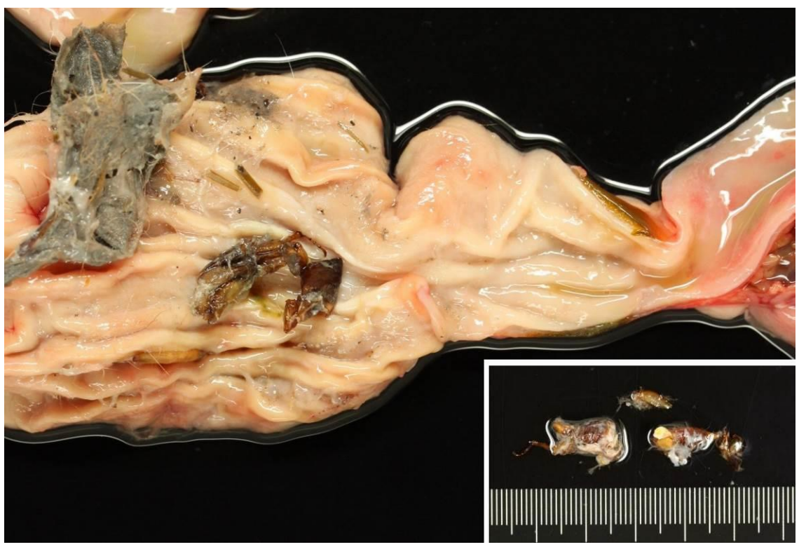
Figure 2. Photograph of the opened stomach with presence of a furball and fragments of cockshafers. Insert: Closer view of the isolated cockshafer fragments. The ruler indicates millimeter (mm).