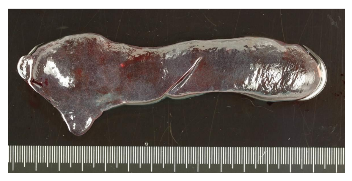
Figure 1. Photograph of the severely and diffusely congested spleen. The ruler indicates millimetre (mm).