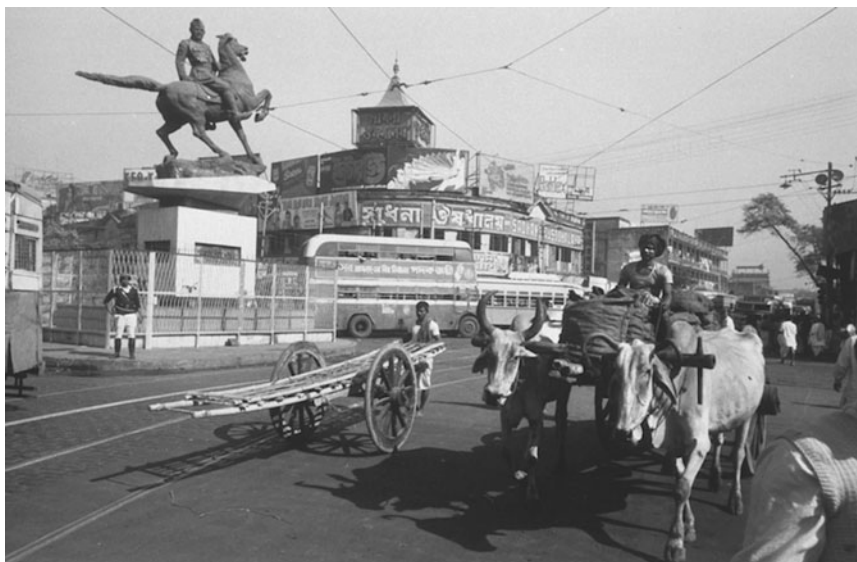
Figure 2. Netaji Subhas Chandra Bose statue, Shyambazar Five Point Crossing, Calcutta, circa 1970.

the national government in New Delhi. Such a development, British officials in India cautioned the Commonwealth Relations Office, might prove counterproductive. In particular, it risked encouraging left-wing politicians in the subcontinent to revisit calls that they had previously made for the Victoria Memorial to include pictures and statues of nationalists who had been prominent in the struggle for India's independence. 108