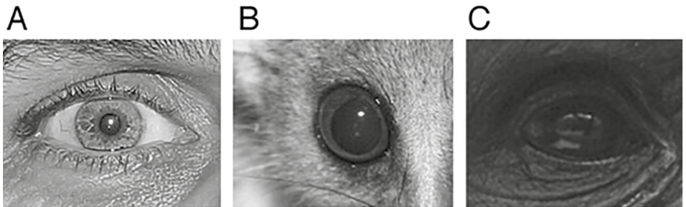
Figure 1. Humans have the largest region of exposed sclera and the sclera is paler than the iris and surrounding skin. Comparison of scleral coloration and exposed scleral region in (A) humans; (B) mouse lemurs, the smallest primates; and (C) gorillas, the largest primates. (Adapted from Haverkamp (2007) and Kobayashi and Kohshima (2001).)

A study investigating the effects of amblyopia on education