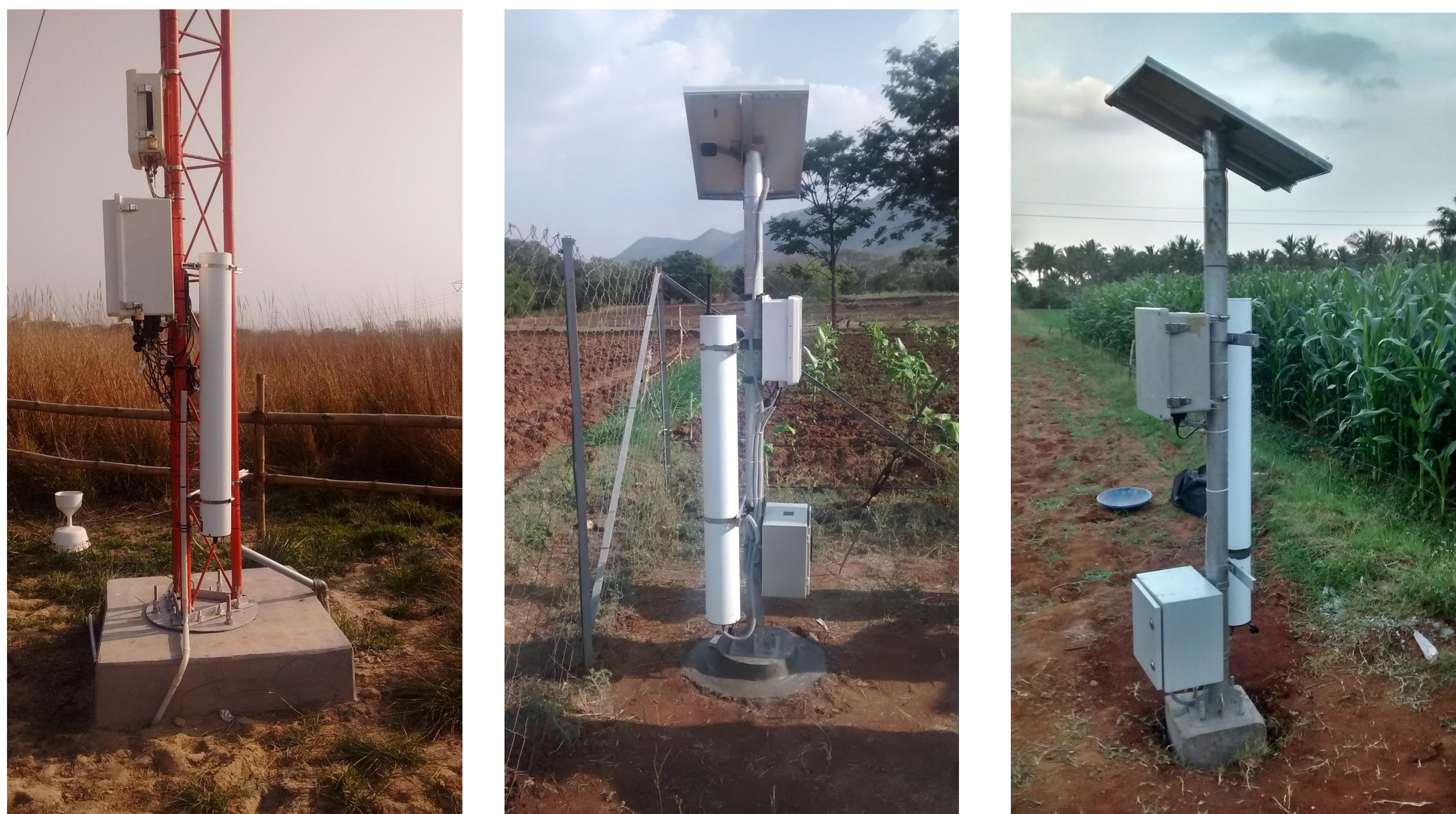
Figure 1. Cosmic-ray soil moisture sensors (CRS) installed at IIT Kanpur (left), Berambadi (centre) and Singanalur (right).