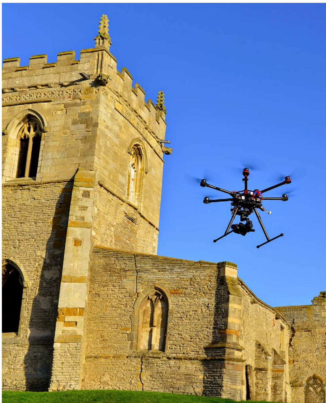
The new Hexacopter