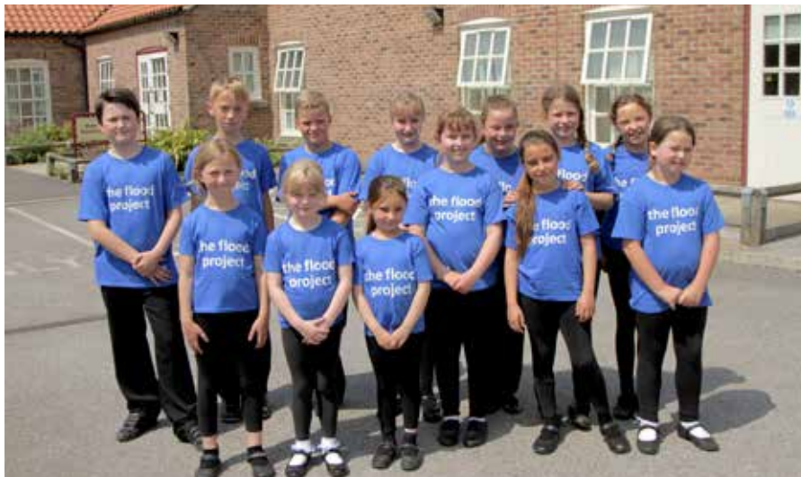
Taking a break: children from South Ferriby Primary School