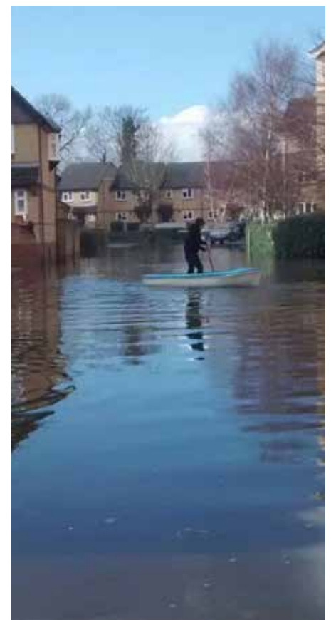
Photo: Flooded street in Staines-upon-Thames