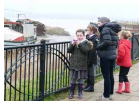
Fig 2: Walking and photographing the local landscape