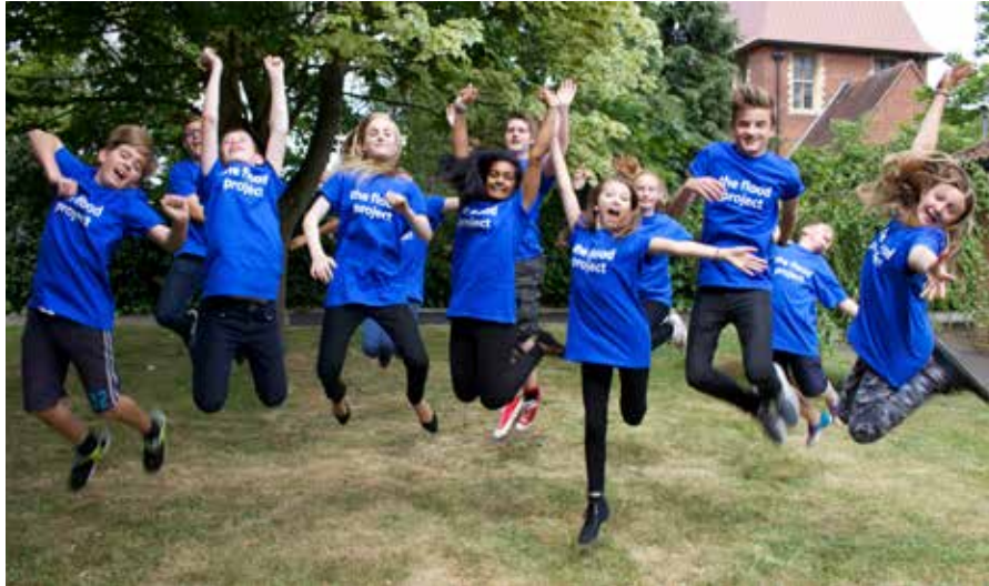
Jumping for joy: young people from The Magna Carta School