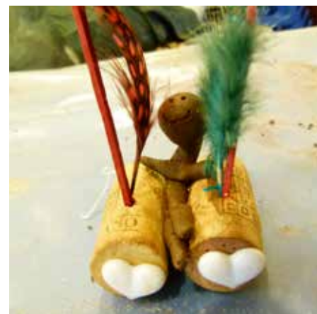
Fig 9: Richard's model of a raft

Children expressed an understanding that what counts as normal has in fact changed. They recognise that there is a 'new normal' which includes flooding and taking measures to prepare for and adapt to flood events.