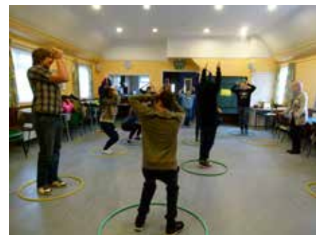
Fig 1: Warm-up game

In this way, data collected during workshops and the stakeholder events included: photographs; video and audio recordings of walking, discussions and phototalk sessions; group discussions during sandplay, 3D modelling and theatre activities and interview transcripts. Audio recordings were transcribed. This multi-media material was coded and categorised thematically in research team meetings and organised using Atlas.ti software. Key themes were taken back to the children for discussion and to support the development of their stakeholder presentations and Flood Manifestos.