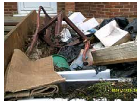
Fig 5: The skip, one of many photos taken in Staines-upon-Thames by the young people during a walk around the local flood-affected area

... shows the destruction the floods left.... It shows all people's memories and all their, like, precious things that got ruined.