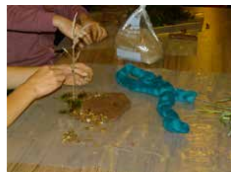
Fig 4: Model making