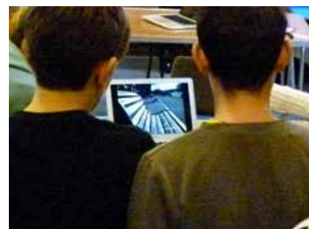
Fig 3: Phototalk session