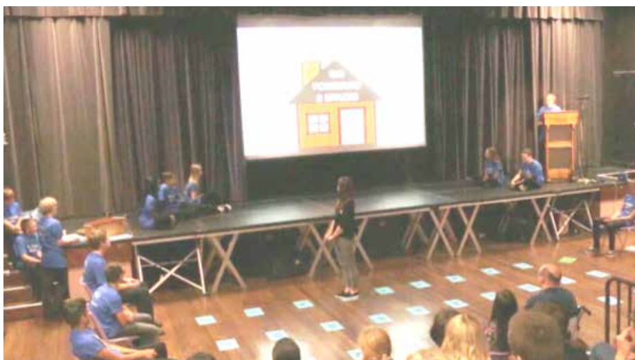
Fig 10: The 'flood snakes and ladders' stakeholder event

At the end of the performance, audience members were given the Flood Manifestos and invited to respond by writing a pledge about what action they would take based on what they had seen (see Appendices 3 & 4).