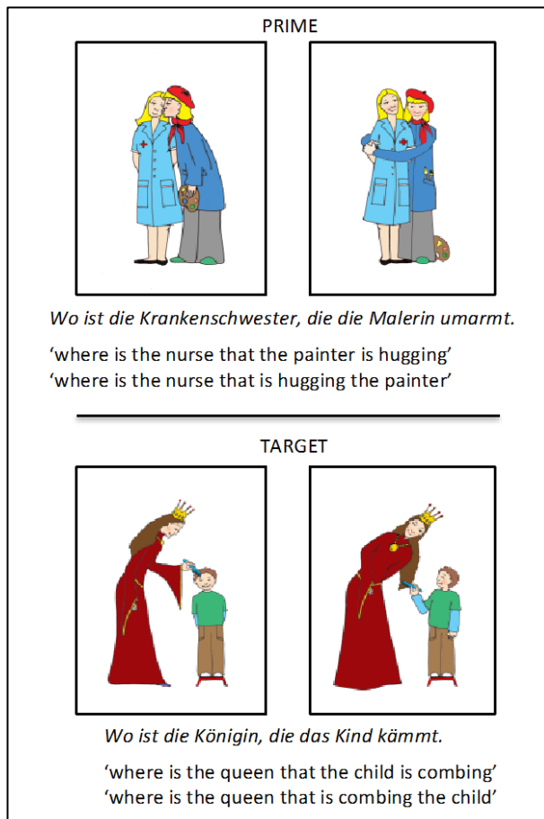
Figure 2: Ambiguous primes