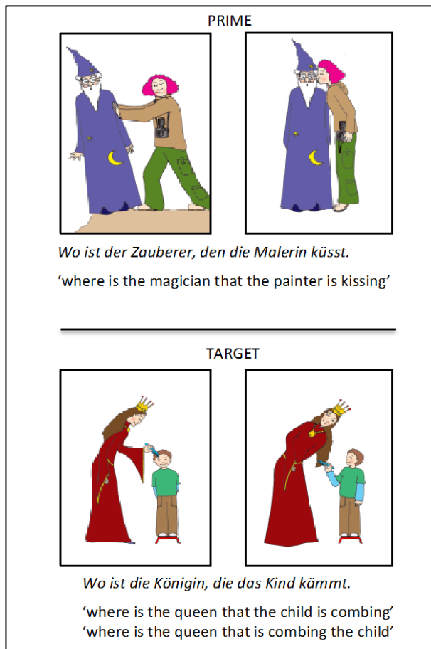
Figure 3: Case disambiguated primes