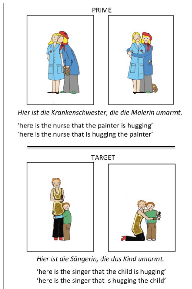
Figure 1: Primes and targets with lexical overlap (Nitschke et al., 2010)