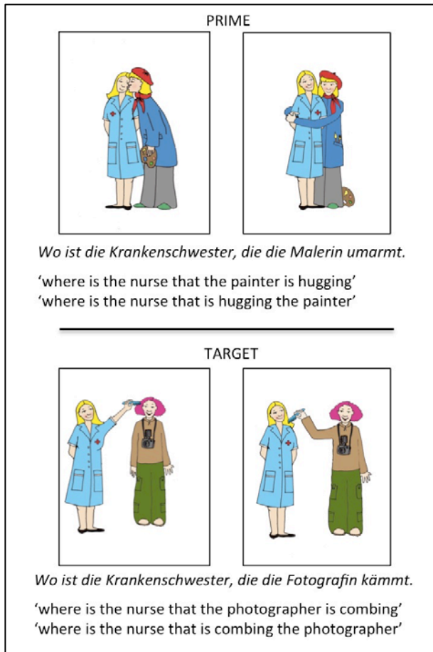
Figure 4: NP1 Overlap