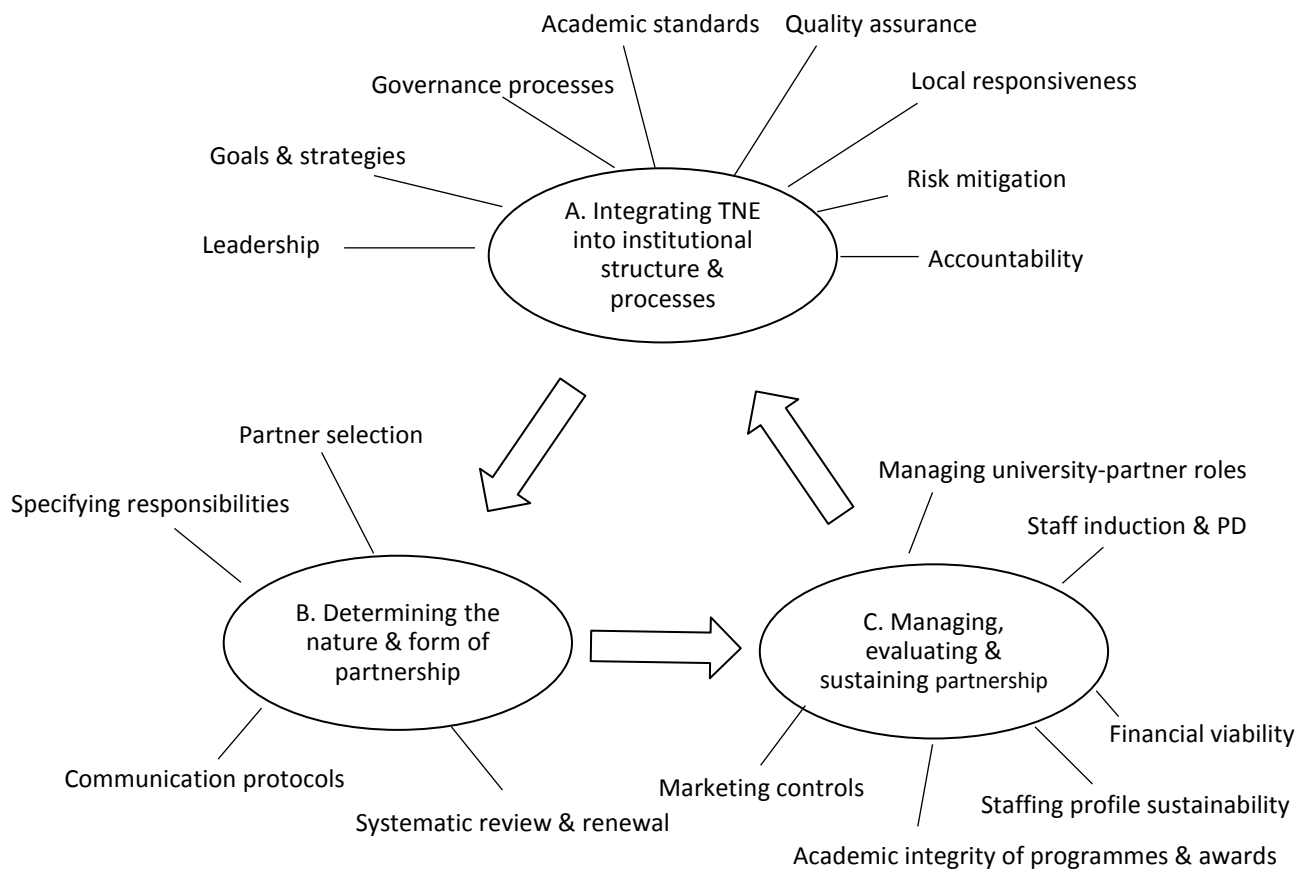
Figure 2. Factors impacting the three summative clusters