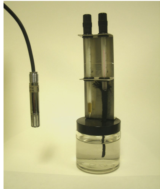
Fig. 2 Water vapour (humidity) sensors may be relatively inexpensive capacitance hygrometers ( left ) or a basic psychrometer ( right ).

absorbs infrared radiation, particularly in the 2,500–3,000 nm waveband, it is important to either remove the water vapour before measurement (by drying for example with a desiccant), adjust the sensor reading to account for the presence of water vapour, or alternately, install a pass-filter (interferometer) in front of the IR detector to ensure that only wavelengths that are absorbed by CO 2 are able to reach the detector. Zero calibration is performed by supplying the sensor with pure nitrogen gas. Additional calibration can then be performed using a calibration gas with a known CO 2 concentration at the high end of the measurement range. When air samples are drawn from (warm) greenhouse sections and pumped to a (colder) CO 2 sensor located outside the greenhouse, care should be taken to avoid condensation in the sampling tube, pumping system, and sensor components.