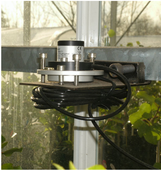
Fig. 1 A quantum sensor on a leveling platform mounted at the top of the canopy for measuring photosynthetically active radiation (PAR). Radiation sensors should be chosen for the specific purpose required. Positioning should be carefully considered to avoid shading or noise from reflective surfaces.