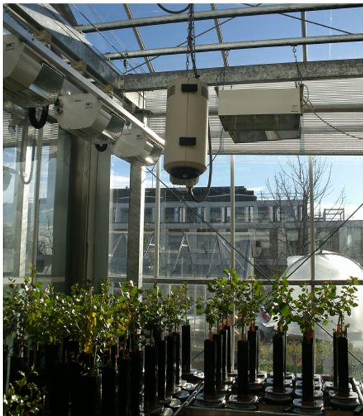
Fig. 3 An aspirated sensor box suspended centrally in free air for recording environmental parameters. The sensors are located inside the box while air is constantly drawn through the box. Sensor (box) type and location along with frequency of sampling and details of data integration should be reported.

about the transmission of radiation through the greenhouse structure. Outside radiation can also be used as input for the greenhouse control strategy [15, 16].