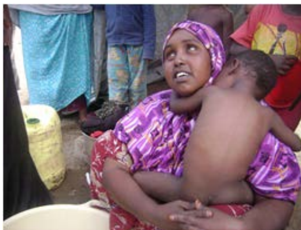
Fig 8.3 Somali mother and her son