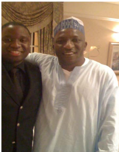
Fig 7.1 Two friends from West Africa at the Black History Awards dinner: 2009

who is also the person to hand out the awards. The food is prepared in the West African way and served. After the meal and the keynote speakers address, the awards are handed out and entertainment offered. Then the socialising happens and people would normally move from their allocated table to friend's tables and socialise.