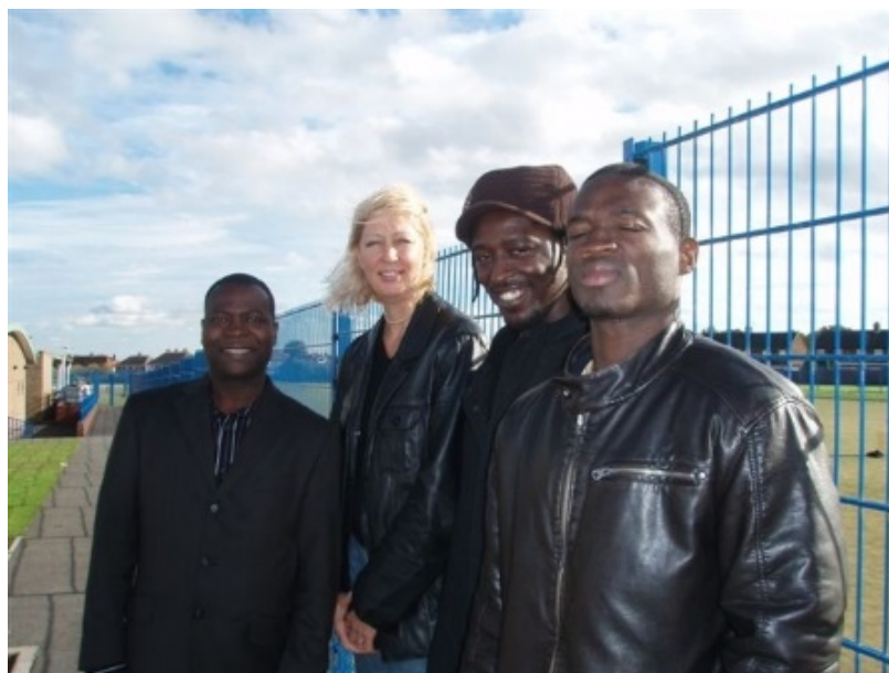
Fig 3.1 Fieldwork in Teesside (2009) – with some informants