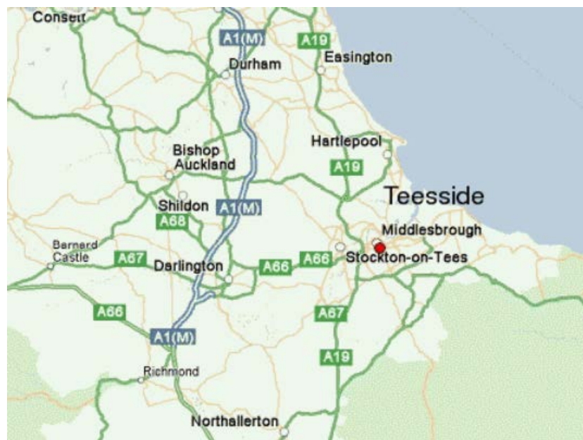
Fig. 1.1 Map of Teesside

The area then became known for its labour intensive work and all the issues that came with it. A large working class structure was established out of the industrial growth and the business centres that came with it. This includes the development of the towns (Middlesbrough, Stockton-On-Tees, Billingham, Redcar, Hartlepool and Marske) that made out the Teesside area. As shown on the map below: