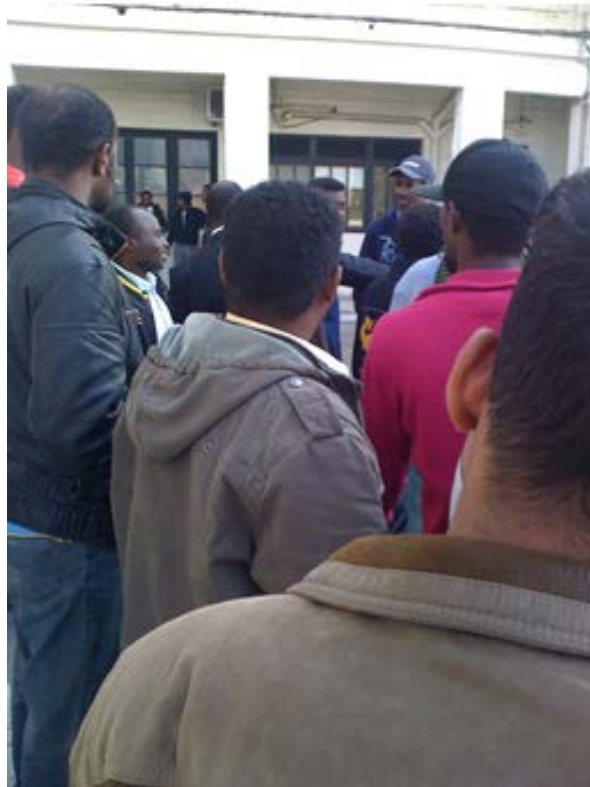
Fig 8.9 Marsa Open Centre, Malta

At Marsa Open Centre (MOC) the refugees are given a bed, two meals a day and rudimentary leisure possibilities. These consist out of watching television, playing cards and pool. The population in MOC is only men, and mostly young men. Previously the buildings were used as a school. The classrooms are now used as bedrooms, packed with double bunk beds and the larger spaces are also crammed with beds. There are sections clearly set up as to the country the inhabitants are from. There are also