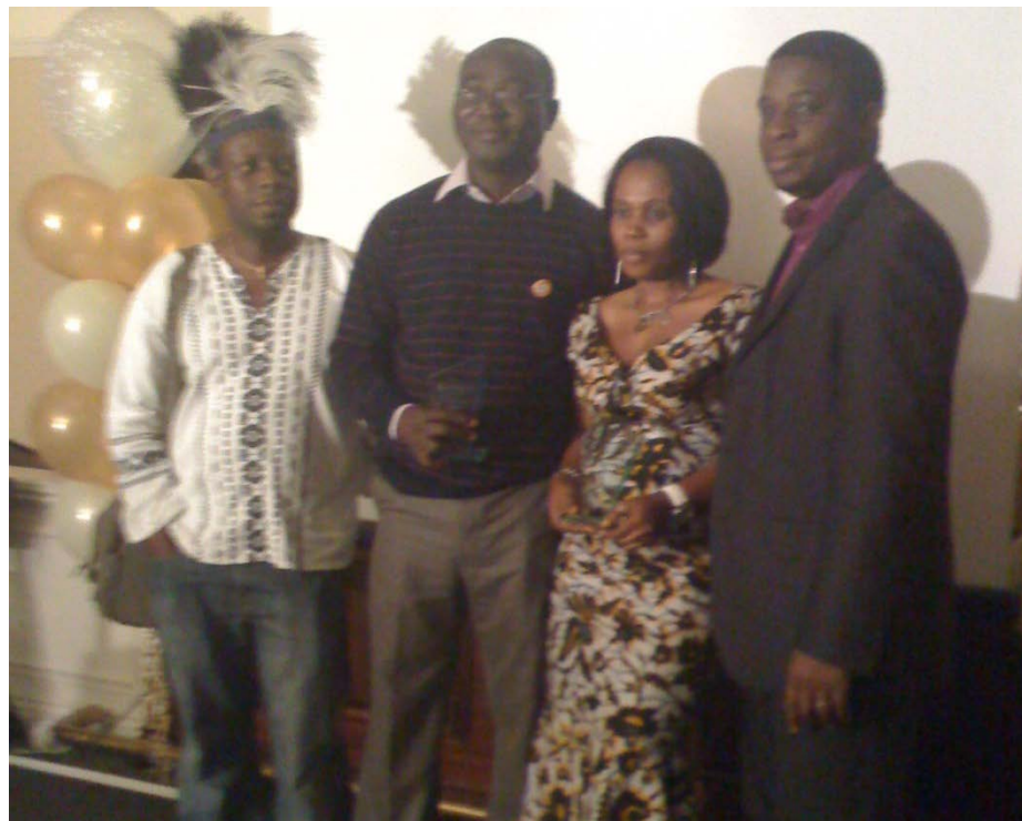
Fig 7.2 Some of the prizewinners at the Award Dinner. Each of the four winners are from different counties in Africa