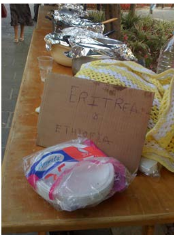
Figs 8.7 & 8.8 Eritrean food stall at cultural event, Valetta, Malta

The asylum seeking and refugee system in Malta is as follows; the asylum seeker would upon arrival be taken to a detention center (an old prison is used for this purpose) and he or she will be kept there for a period of eighteen months. Thus, behind lock and key while their authenticity is confirmed and documents arranged. Koshravi (2011, p. 101) uses Foucault (1977) who writes that the modern prison is assigned the task of administering its inmates' lives in order to foster 'docile and useful bodies'. This is in contrast to the immigration detention center which he describes as a pre-modern prison.