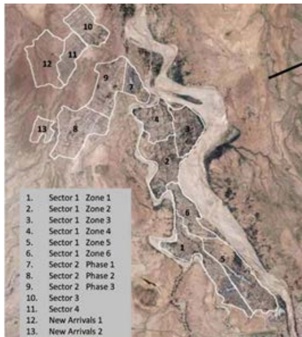
Fig 8.4 Plan of Kakuma refugee camp