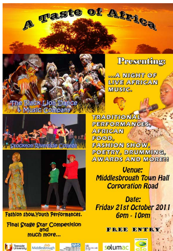
Fig 7.3 Advertising leaflet for the Taste of Africa event

This event also takes place in October as part of the Black History month celebrations in Teesside. The leaflet that is distributed to advertise the event is colourful and shows several pictures of the performers and features that makes up the event. This is showcasing the new community in Teesside to the local host. It is free to all and the audience is given a meal as part of the evening.