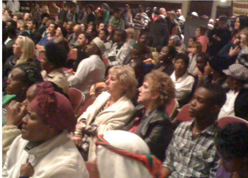
Fig 7.4 Part of the audience at the Taste of Africa evening in Middlesbrough town hall