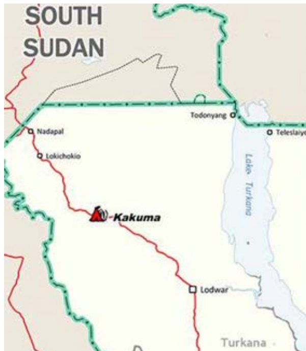
Fig 8.2 Map of North-East Kenya showing location of Kakuma

We left early in the morning to the town for the meeting with the UN representative, and the rest of the day I was taken through the camp by the guide and driver. The camp was divided in the following way: The reception was where new arrivals were directed to. There they were noted in the little office and the paperwork completed. The numbers of the daily arrivals were taken down on a white board, and later in a book. Then the new arrivals are assessed according to need, for example a widow or a woman with or without children is classified as a dependent for they would then need assistance in