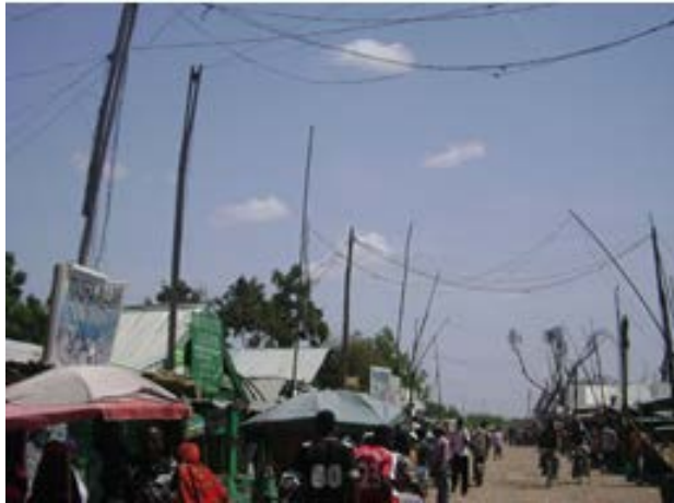
Fig 8.5 A street in the commercial district of Kakuma Refugee camp