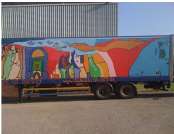
Fig 6.1 The trailer: Escape to Safety

explanation. The tape-recorder is handed to the students and they enter into the trailer. First the village chaos is shown with shoes, clothes and cooking utensils are strewn. The next stage they walk – videos demonstrate by showing mass exoduses of people. This is shown on the walls of the dividers. The next step is set up as if inside a container and the students are asked to climb in. They are then placed in the container tightly next to the fruit being transported. The next stage is detention; a small cell with a narrow bed in. Then the ‘crossing a border’ section where they are let through a gate out to the outside. This is at the back of the trailer. In the classroom, some assistance was given to Hilaire in the workshops by the volunteers, but in all Hilaire did the work. Here, as explained, he had to tell his own story over and over and then go into an educational presentation of the refugee in the world. The whole programme was designed on a pedagogical basis to educate the students about asylum seekers and refugees in the UK.