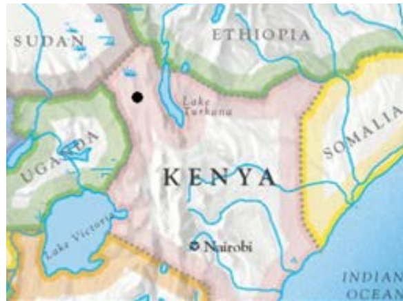
Fig 8.1 Map of Kenya and surrounding countries

there would be forty thousand Sudanese refugees there, too and that would become our home for one year, for two, then five then ten. Ten years in a place in which no one, simply no one but the most desperate, would ever consider spending a day. (Eggers, 2006, p. 362)