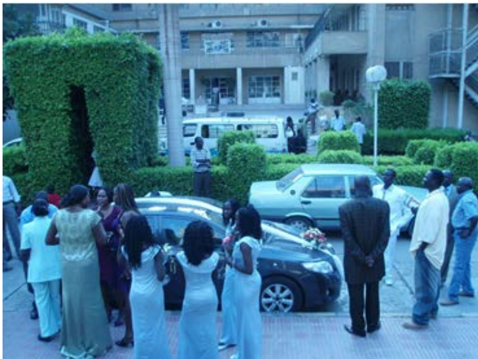
Fig 8.6 The wedding at All Saints in Cairo (2010).

Back at the accommodation, I went to the Church. I wandered towards the open space in front of the main building – the cathedral. I joined George and sat talking to him. After a while we were joined by other men, until there were six of us sitting in a row, watching people coming and going. To me it felt like that of a village square, which even the African villages and/or small towns have. As far as the men, including me; it was an observation point. Young women enter the space with a ‘task’ at hand; this is presented by the way they walk across the open space, with a purpose towards the end point. This may be the shop or the clinic. Men on the other hand, saunter in and greet with handshakes and enquiring after health of family and friends, then either move on or stand for a while until they continue to the destination, also the workshop or clinic.