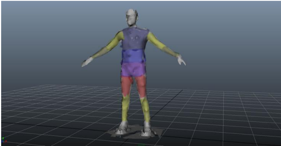
Fig. 2. An example of 3D model based on the 3D laser scan of the subject

of the body with no arms, as it was intended to study the actual contribution of arms to the lower extremities of gait. Out of the 11 non-arm volume correlated features, only two were related to the lower extremities while the remaining contributed mostly to arm related dynamics.