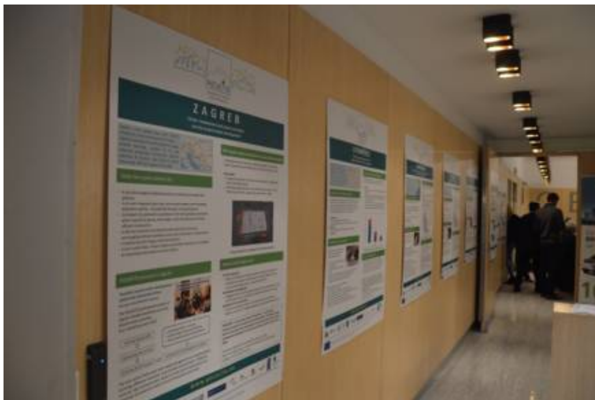
Figure 1: Case study cities posters at the Final Conference