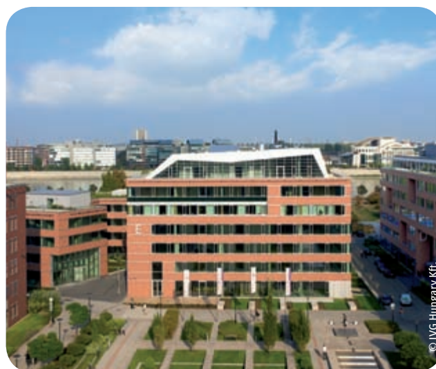
The EIT Headquarters will be finished and operational in spring 2010. The EIT staff starts working from the new EIT Headquarters in Budapest by spring 2010.

To give them a running start, the EIT is awarding a €3 million start-up grant to the KICs. So the KICs can immediately start putting in place organisation and management structures, the IP board, the business plan, as well as securing the commitment of the various partners. The KICs will become fully operational shortly after the signature of the first annual grant agreements due by June 2010.