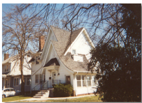
The Larned A. Waterman Iowa Nonprofit Resource Center 130 Grand Avenue Court Iowa City, Iowa 52242 Toll free: 1.866.500.8980