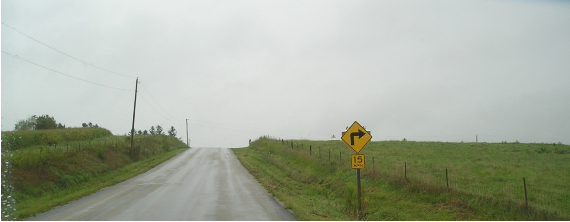
Figure A.5. Turn warning sign with advisory speed plaque