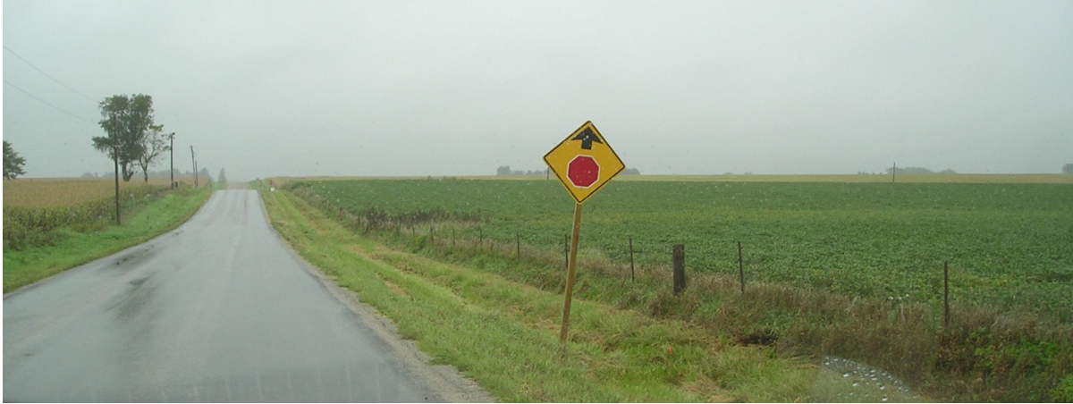
Figure A.9. Advance stop warning sign with leaning support