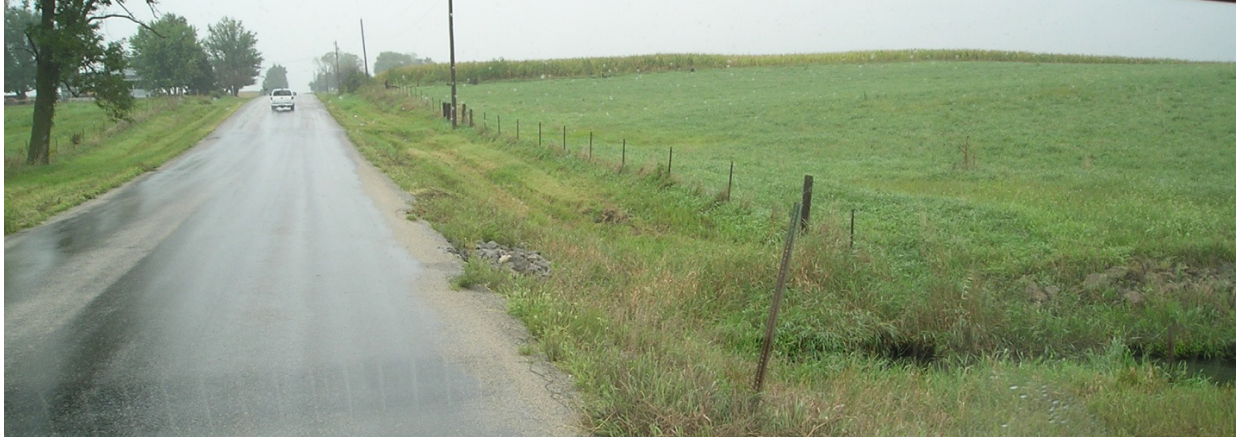
Figure A.7. Large opening culvert