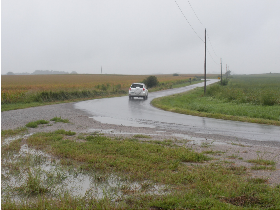
Figure A.3. Horizontal curve at 270th Street intersection