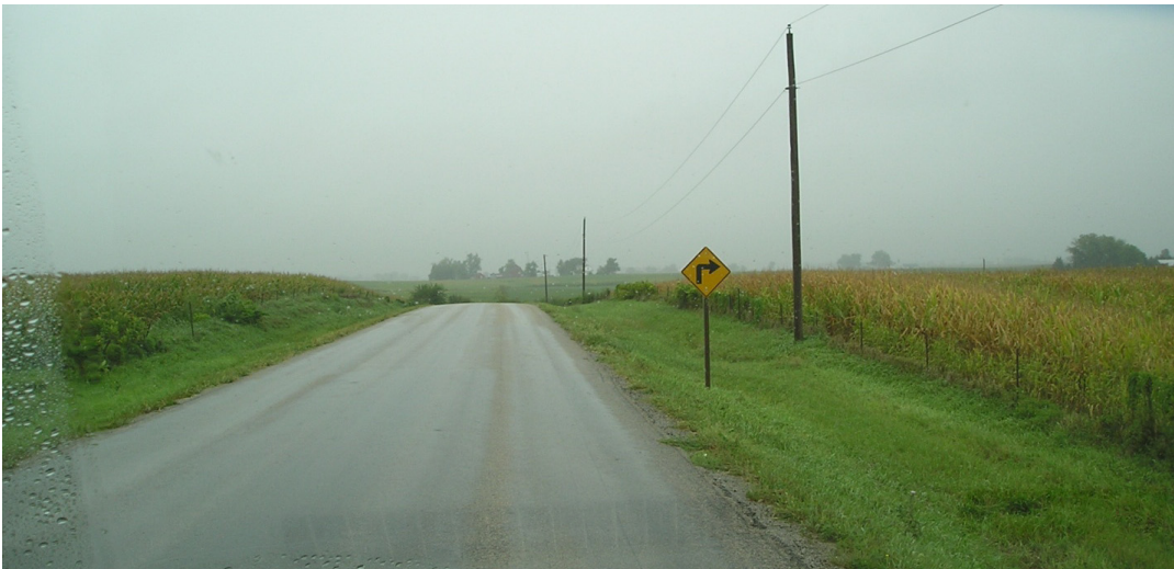
Figure A.4. Turn warning sign