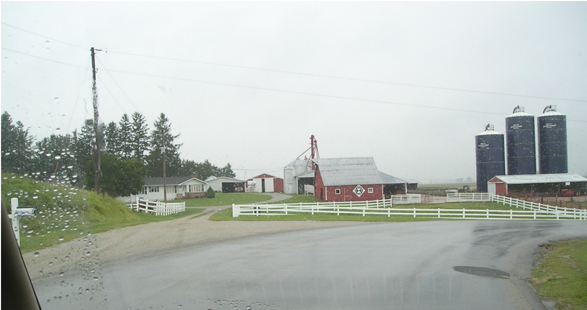
Figure A.6. Farmstead at initial curve north of Tiffin