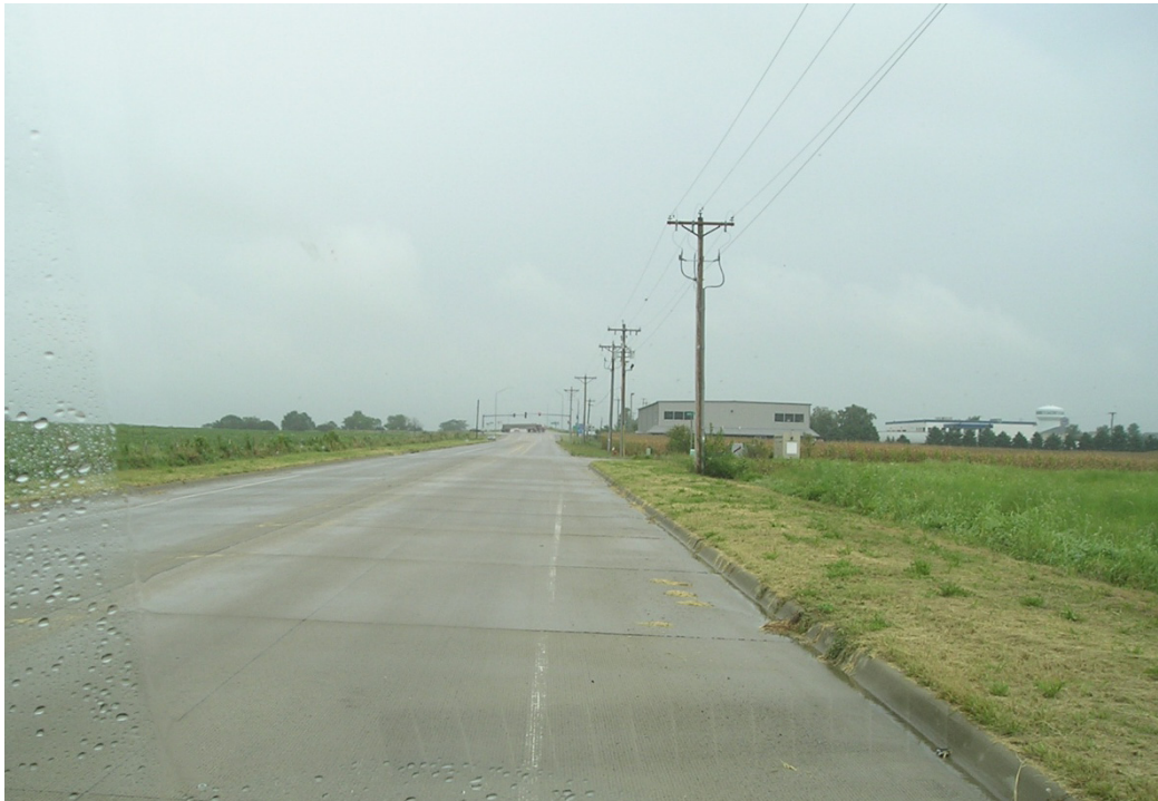
Figure A.10. PCC curb and gutter section west of I-380 interchange