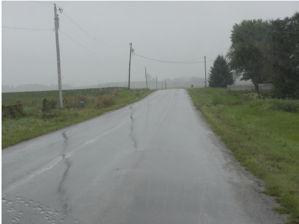
Figure A.1. Typical reviewed roadway section