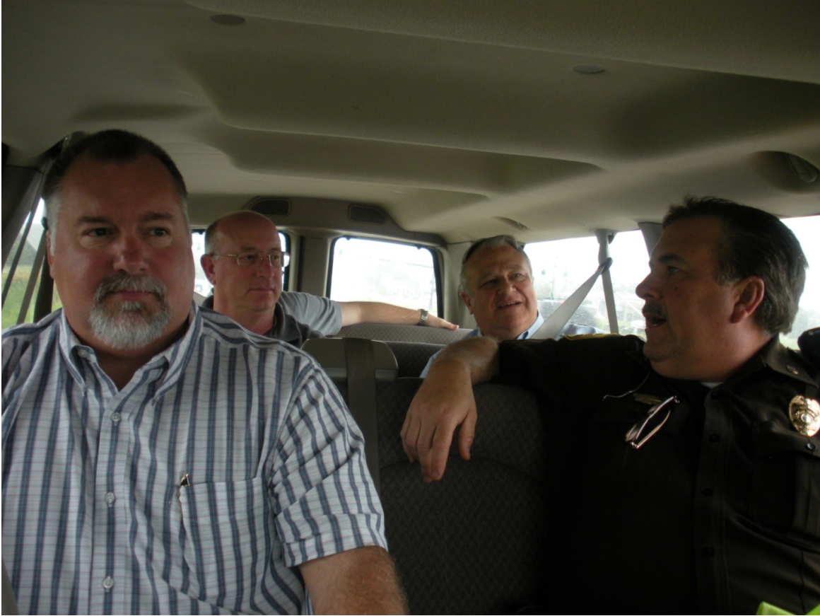
Figure A.13. Review team during daylight field inspection