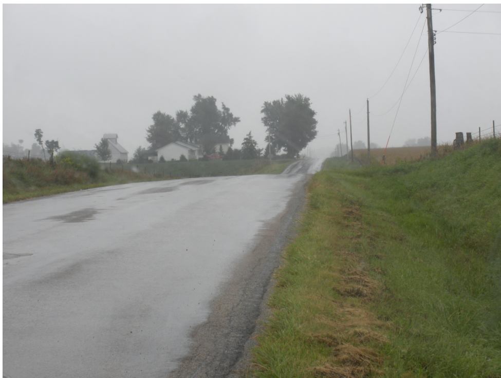
Figure A.2. Roadway section with right of way shown