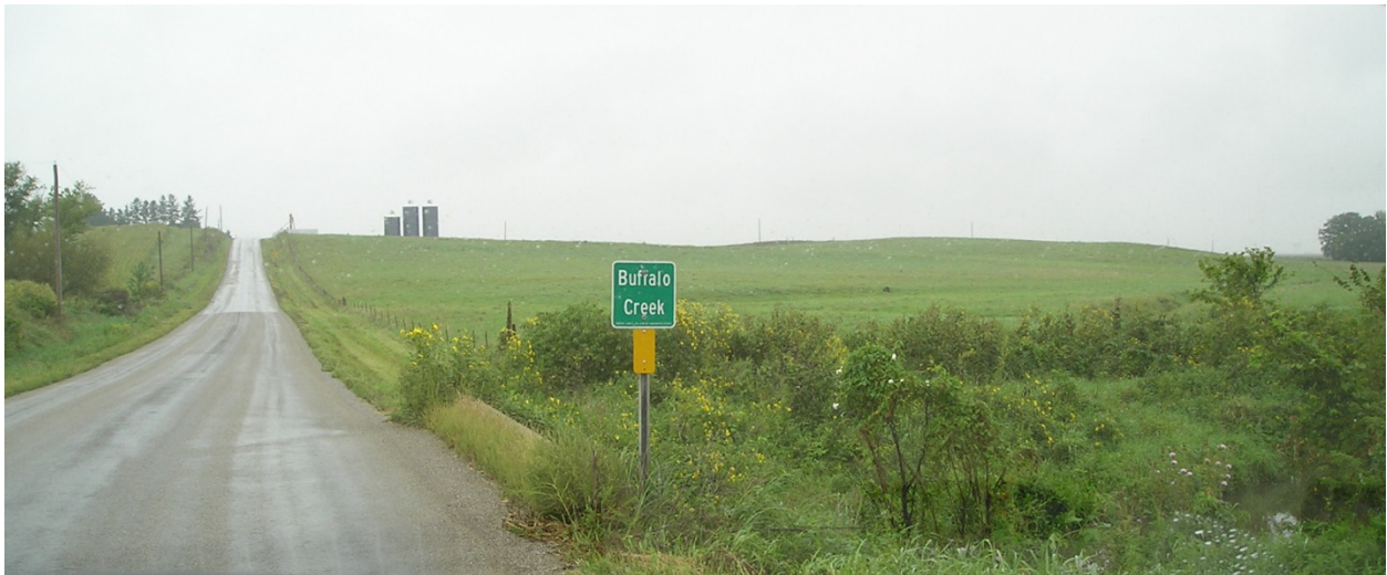
Figure A.8. Large opening culvert just north of Tiffin