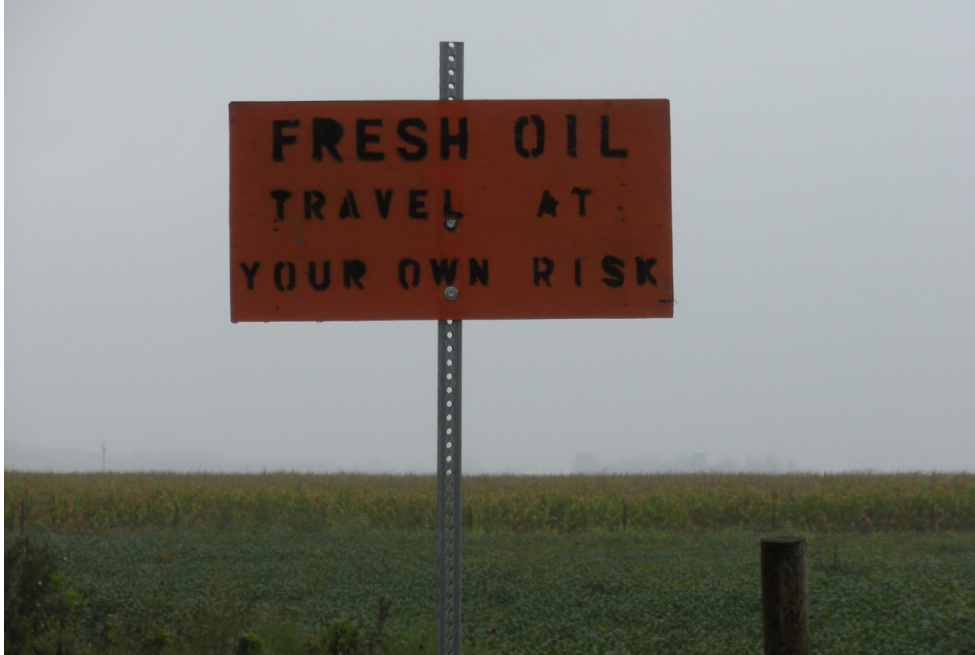
Figure A.11. Non-compliant sign west of I-380