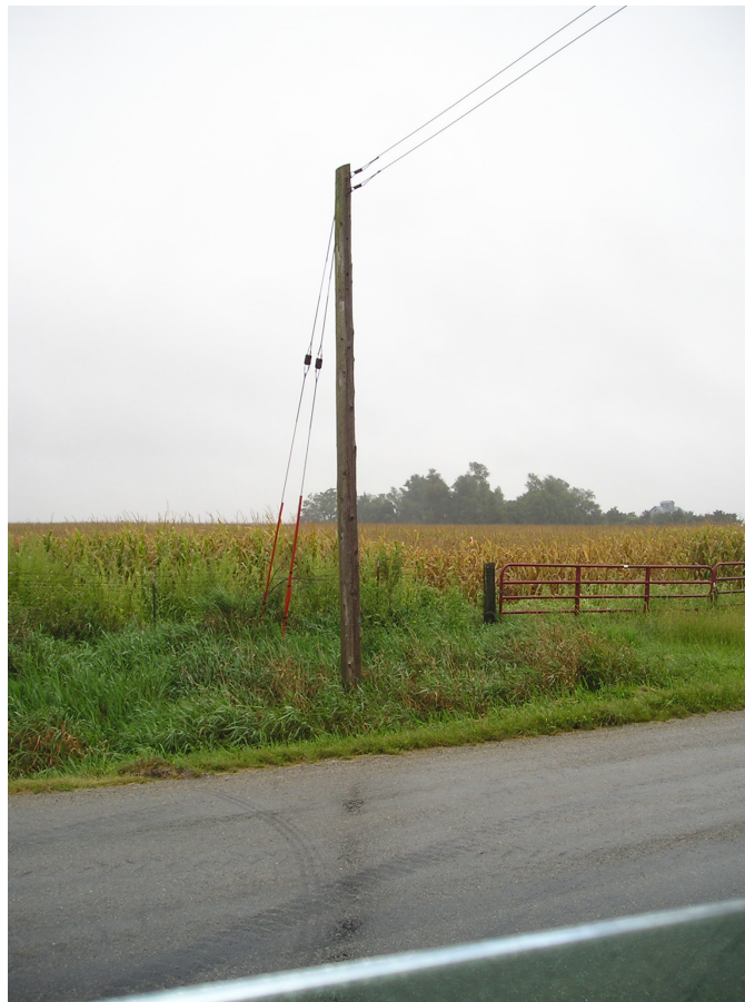
Figure A.12. Guy wire brace in clear zone