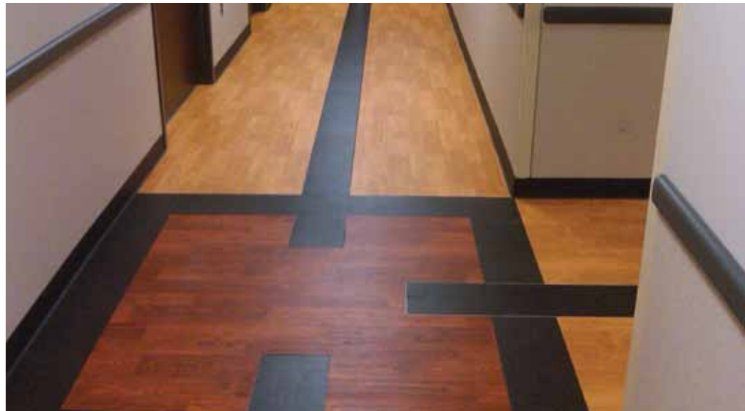
First floor renovation of the Iowa City Department of Veterans Affairs by Covenant Construction Services (hallway pictured)

At that first meeting, one immediate opportunity identified was whether or not Covenant qualified as a Service Disabled Veteran-Owned Small Business (SDVOSB). This program is one of several small business initiatives that the federal government has created to promote opportunities for capturing federal work. Qualified companies may be eligible for sole source or “set-aside” contracts, which limit competition and increase the company’s chances for securing sales. CIRAS recommended that Covenant apply for verification as an SDVOSB, and the company received its official verification in 2010 from the Center for Veterans Enterprise.