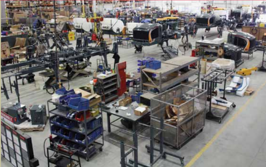
Hagie Manufacturing facility in Clarion, Iowa

Iowa State University does not discriminate on the basis of race, color, age, religion, national origin, sexual orientation, gender identity, genetic information, sex, marital status, disability, or status as a U.S. veteran. Inquiries can be directed to the Director of Equal Opportunity and Compliance, 3280 Beardshear Hall, 515-294-7612. HD11021