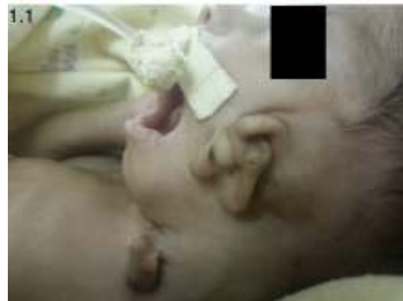
Figure 1 Photograph of the front. (1.1) Profile photograph.

a weight of 1290 g, size 39 cm, a 27.5 cm head circumference and an Apgar score of 8/9, had no dysmorphias detected during physical examination and no bone defects in imaging studies, thus, no genetic studies are performed. He dies after 5 days of life outside the womb due to prematurity-related complications; hyaline membrane disease grade 2, pulmonary hemorrhage and late sepsis, we requested an autopsy from the parents; however, they declined.