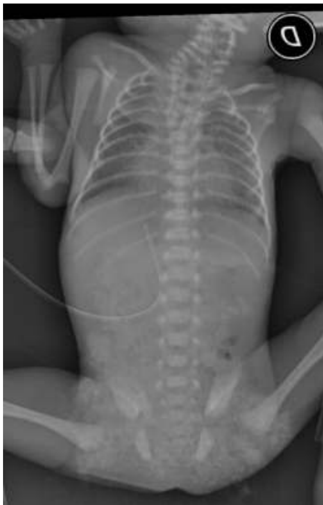
Figure 2 Thoracoabdominal X-ray.

successful extubation. Given the findings observed during physical and radiological examinations the Genetic Service is brought in. They obtain the parents' genetic clinical history, and as a part of the approach of a dysmorphic patient