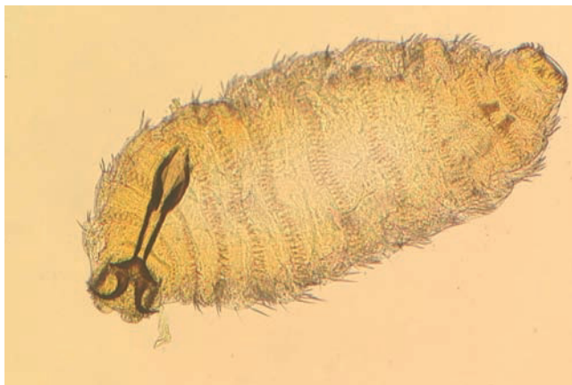
Figure 2 Photograph from an optical microscope ( \times 100 ) showing an Oestrus ovis larva.

of distilled water mixed with eyewash lubricant and prescribed 2 drops every hour. There was no evidence of intraocular inflammation or inflammation of other organs in the eye. The right eye was normal. The patient remained hospitalized and was discharged on the third day given the fact she was no longer displaying symptoms. In her follow-up appointments 3 and 6 weeks after the event, she did not report any symptoms nor were abnormal signs found in the biomicroscopy.