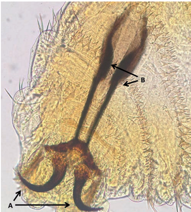
Figure 3 Amplification of a photograph from an optical microscope ( \times 400 ) of the upper or buccal pole of Oestrus ovis . Two horn-shaped buccal hooks (A) attached to a cephalopharyngeal skeleton (B) can be observed.

union postsynaptic membrane and stimulates the generation of nervous impulses which can cause the insects' death. The union of the alkaloid works through two ways: contact with and ingestion of the larvae. This larvacide effect has been exploited for a new generation of insecticides, 11 thus preventing new cases, especially in emerging countries. 12