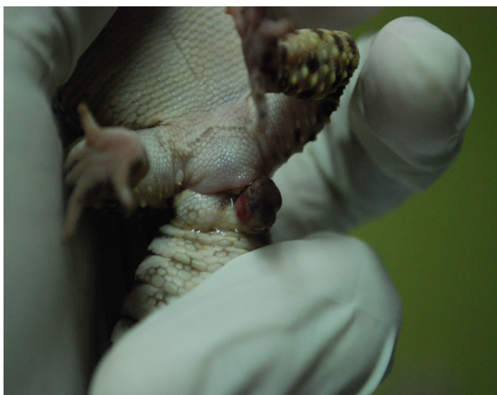
Figure 1. Leopard gecko ( Eublepharis macularius ) presenting eversion of left hemipenis showing evidence of necrosis.

A four years old male leopard gecko ( Eublepharis macularius ) was presented to the Wild and Exotic Animals Clinic, Facultad de Medicina Veterinaria, Universidad Nacional Mayor de San Marcos, Lima, Perú. The animal was kept in a vivarium with sand as substrate, and under humidity and temperature conditions according to recommended range (Kramer 2002; McBride and Hernández-Divers 2004). Three days before presentation, the animal had been placed in a terrarium with a female leopard gecko in order to breed. One day before presentation, the owner noticed the animal had a swelling near the cloaca. At physical examination the animal weighed 70 g, and showed good body condition (3/5). Moreover, left hemipenis was found everted and oedematous. Medical therapy using prednisone (2 mg/kg PO c/24 h) (prednisona, Laboratorios Portugal, Perú) (Carpenter et al. 2014) and rinsing using dextrose 50 % were performed. Next day, swelling had not decreased and hemipenis started showing signs of necrosis (Figure 1). Hence, surgical removal of affected hemipenis was suggested.