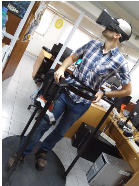
Fig. 2. User on the omnidirectional platform. He is wearing a HMD running a Unity3d application on an Android tablet, and the Arduino Module is attached to his leg.

In order to sense users' movements, an Arduino UNO Microcontroller and a gyroscope are attached to one of their legs. Thus, by measuring the leg angle respecting to the vertical, the system knows whether users are walking or not, and the corresponding direction. Users are also wearing a Head Mounted Display running a Unity3d application which recreates a complete model of them in a virtual environment. That is, a virtual representation of the user's body and environment in an appropriate scale. By using AnArU Framework, a communication between the Arduino on the leg of the user and the HMD application is performed, giving users the sensation that they are really walking inside the virtual environment, increasing the immersion level. In Figure 2 a user with all mentioned components is shown.