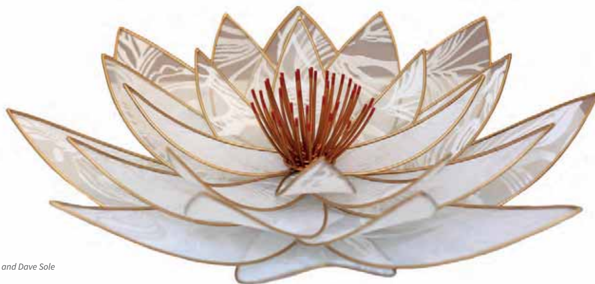
NYPHEA: Jane Pouls and Dave Sole

The creations are priced from $148 to more than $17,000 and are on display until June 29 at the ArtsPost. Entry is free.