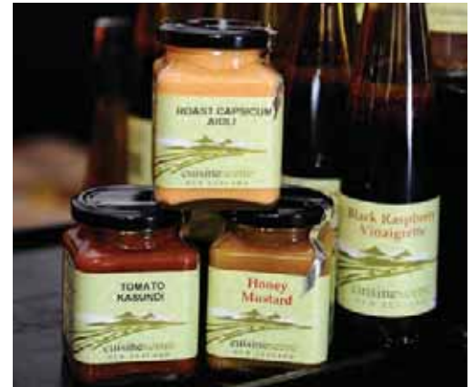
CUISINESCENE TREATS: Condiments carefully crafted by hand

"They're great. I ate so much last year I'm surprised I didn't get myself sick," he said.