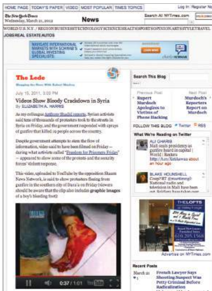
SNN and the NYTimes http://thelede.blogs.nytimes.com/2011/07/15/videos-show-bloody-crackdown-in-syria/

Syria, information on demonstrations and numbers of people killed, injured, kidnapped, tortured or arrested across Syria. All the major towns that have been the most active in the revolt, including Hama, Idlib, Homs and Dera'a, have LCC committee and media groups on Facebook. During interviews for this research, it emerged that the LCC continues to be widely used by United Nations agencies, journalists, and human rights groups to gather data from inside Syria. These activist networks, and others like them, have established direct links with international media.