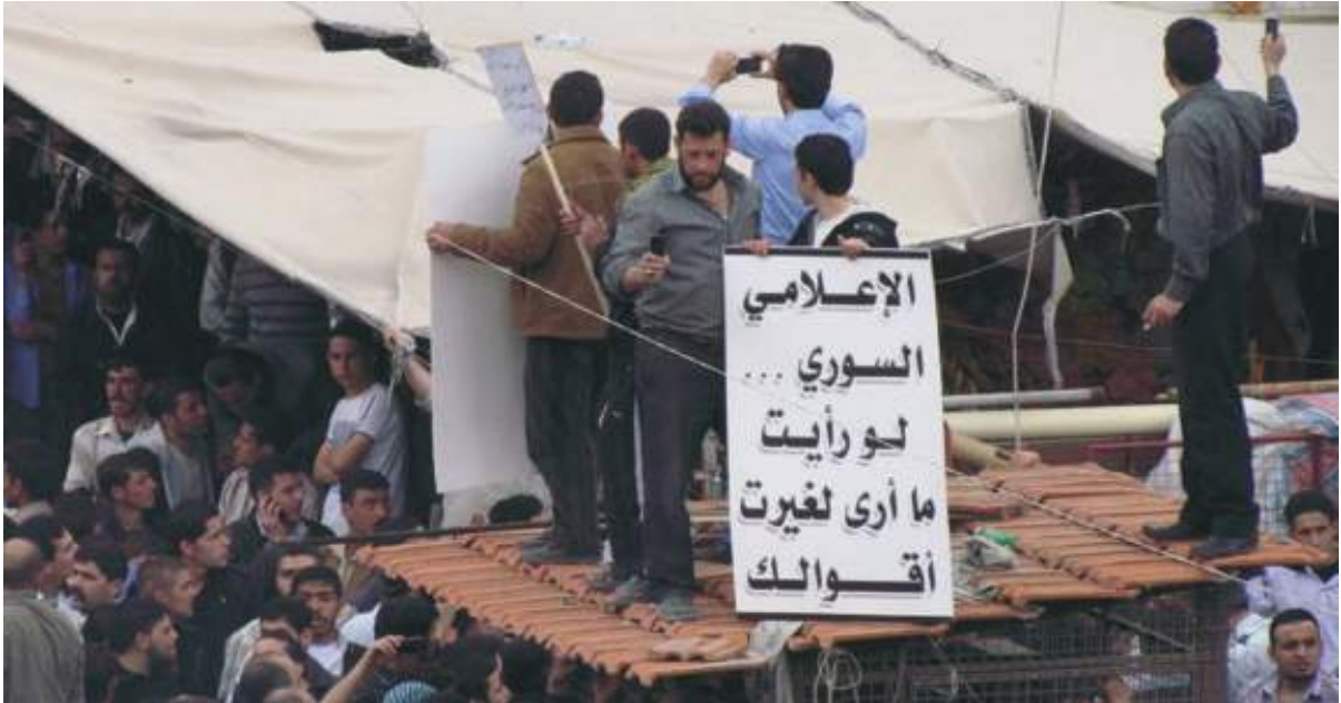
Syria Damascus Douma Protests.

“If you compare BBC World’s undercover report from Syria, where it can be seen some civilians have taken up arms, with the activist sources and content coming out of Syria, it is clear that some of the activists censor images where it can be seen that civilians are taking up arms.”