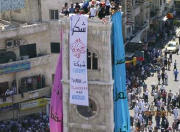
In this citizen journalism image provided by Shaam News Network, Syrian anti-government protestors hang a banner in Arabot that reads: “thank you Al-Jazeera and Shaam News Network,” during a rally on Friday in the central city of Hama, Syria.