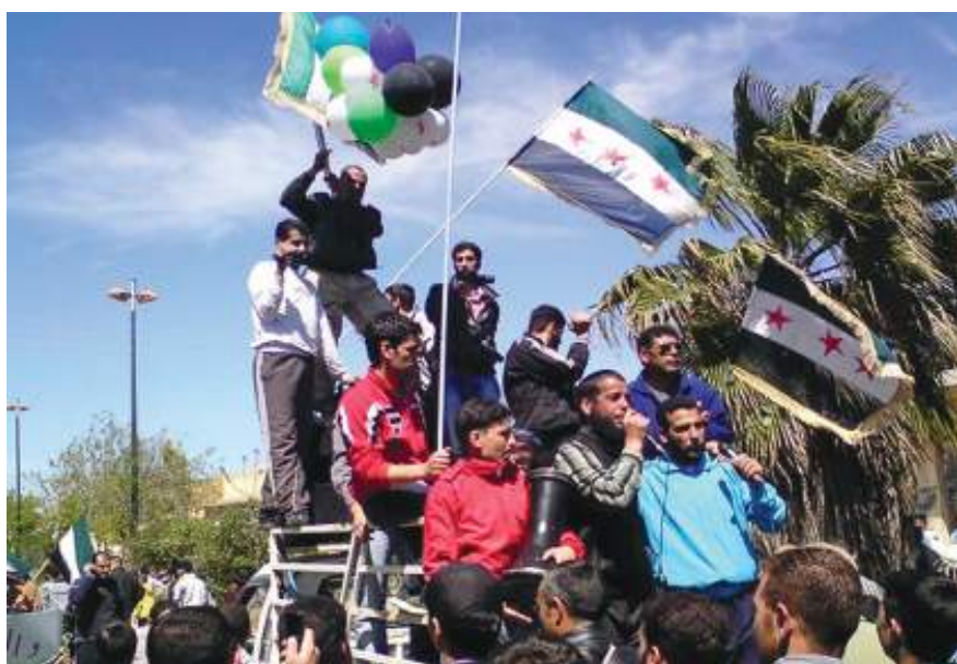
Demonstrators, with balloons and the Syrian opposition flags, protest against Assad after Friday prayers in Al Qasseer city, near Homs.