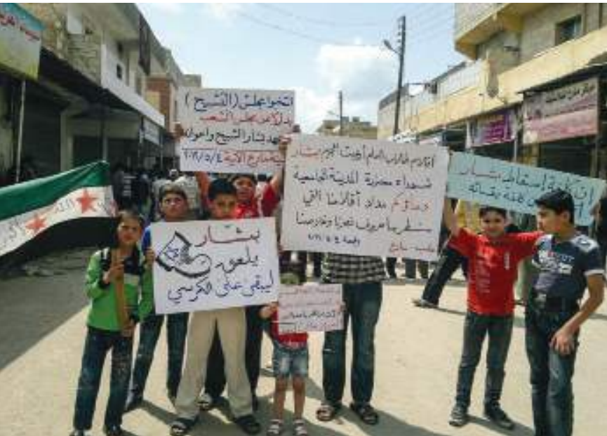
Protesters in Maree, Aleppo Suburbs, Syria.

range of different points of view and political factions. Moreover, Syrian intelligence is setting up fake Facebook pages and groups in order to spread disinformation to the world's media. In March 2011, few Facebook groups existed relating to the uprising in Syria (one of the main ones being the Syrian Revolution 2011 Facebook page). But since the evaluation was carried out, Syrian activists have set up a multitude of social media sites. Despite this the channels continued to have general references to Facebook sources even in July, long after the proliferation of groups on the social network. So, while it might have been sufficient at the start to make only general references, this does not hold true for future reporting.