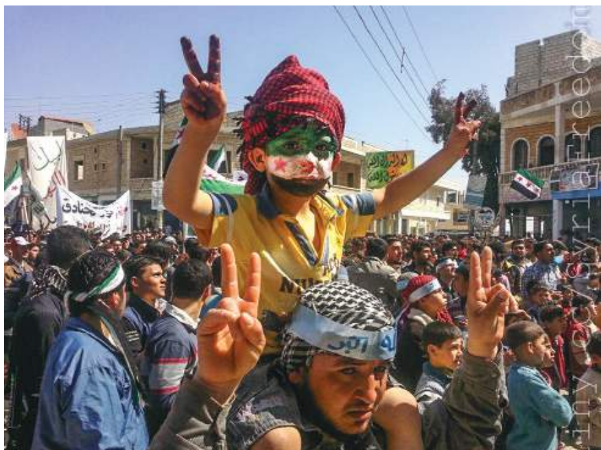
Protest against Assad regime in Binnish, Idlib.

The battle for public opinion is nothing new to conflicts. The new features in this battle are the easy availability of mobile phones that can take high-quality pictures and video and digital platforms that allow for global distribution of this media. As news organizations have become more reliant on a range of user-generated content in Syria, social media platforms have become just another front in the conflict. Activists in the country have taken advantage of the available platforms to get their story out, but some over-zealous members of opposition groups have propagated misinformation or filtered out information that runs counter to their aims in the battle to challenge the regime's narrative. The regime's own effort to control the information environment has been manifest in state-controlled media but has also extended to digital media and social media