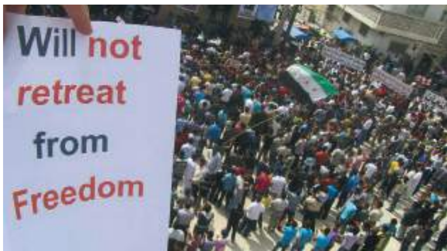
Demonstration against Assad regime in Ma'arat al-Nu'man, Idlib, Syria.

In terms of UGC management both BBC Arabic and Al Jazeera Arabic publish information about their corporate-wide editorial guidelines that set out guidance for dealing with sources and