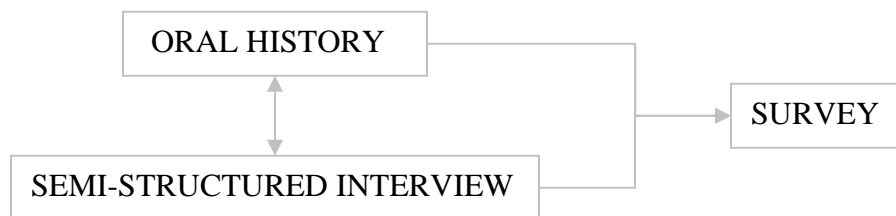
Figure 2: core set of methods for on the ground research

Building on the differences and relative strengths of these methods, our framework operates by moving from the techniques that allow the interviewees the greatest freedom to express themselves using their own language and worldviews (left of the spectrum), to the ones that allow researchers to ask more focused questions and to employ more traditional public opinion research techniques (right of the spectrum). By conducting a survey following rounds of oral histories and semi-structured interviews, as illustrated below in Fig. 2, a researcher can build on the language and issues that directly emerge from the interviewed population and can avoid, at least partially, the imposition of external language and interests on the population affected by the conflict. This process is aimed at translating “exmanent” questions (those based on the worldviews and interests of the researcher) into “immanent” ones (those reflecting the respondents’ worldviews) (Jovchelovitch & Bauer, 2000).