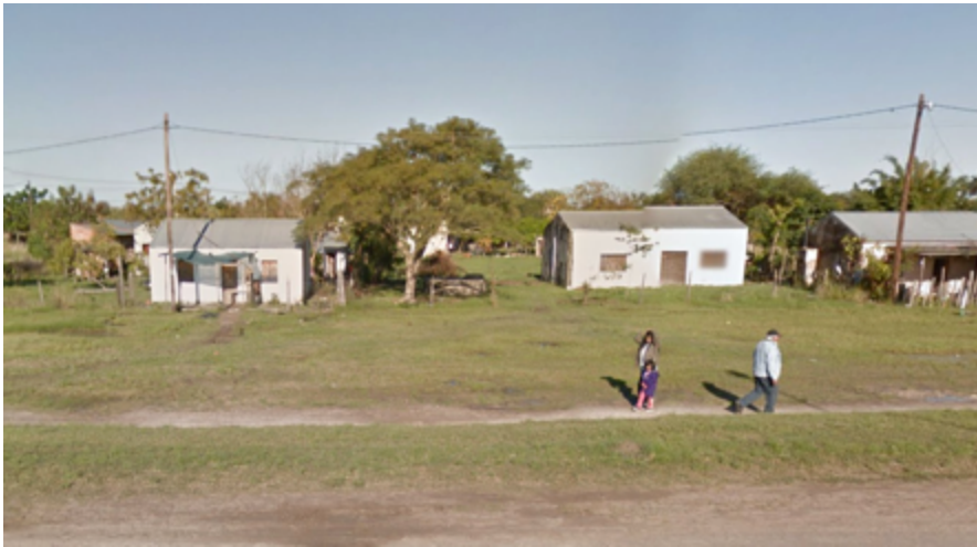
Figure 6: Government Housing

Houses in Lot 84 are of two types. The first is the one made by government contractors, which is simple and rectangular, made of clay masonry blocks, mortared together, painted in white stucco, and roofed simply with metal sheeting (see Figure 6). A separate outhouse and water tank accompany houses like this, because “the Indian’s custom is to have the bathrooms outside”, as one city dweller told me. The other kind of house is erected without capital or government assistance, usually of felled and split palm trunks mortared together with cob, a structural mud-grass mixture. Windows are covered in old sheets and blankets, while palm fronds and salvage metal are used for roofing. Privies are constructed likewise, using free available materials to mimic the style of the government houses. The government houses are considered to be nicer and more desirable, as are larger plots, but everybody realizes that the difference between the nicest and worst houses in Lot 84 is not great.