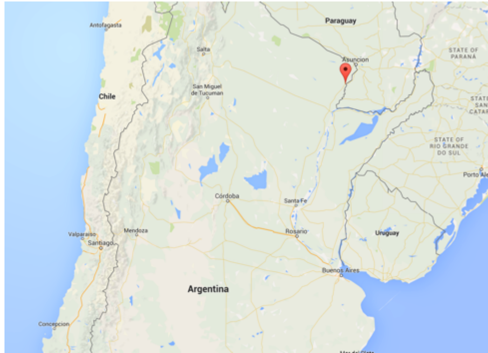
Figure 1: Map of Fieldsite within Argentina

the Pampas and east of the Andes, the broad hot scrubby plain remains mostly forgotten by academics and laymen, much as it was for large portions of the colonial period.