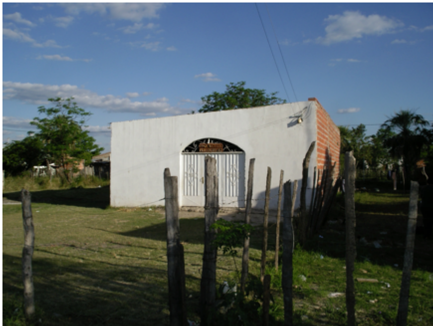
Figure 5: A Pentecostal Church