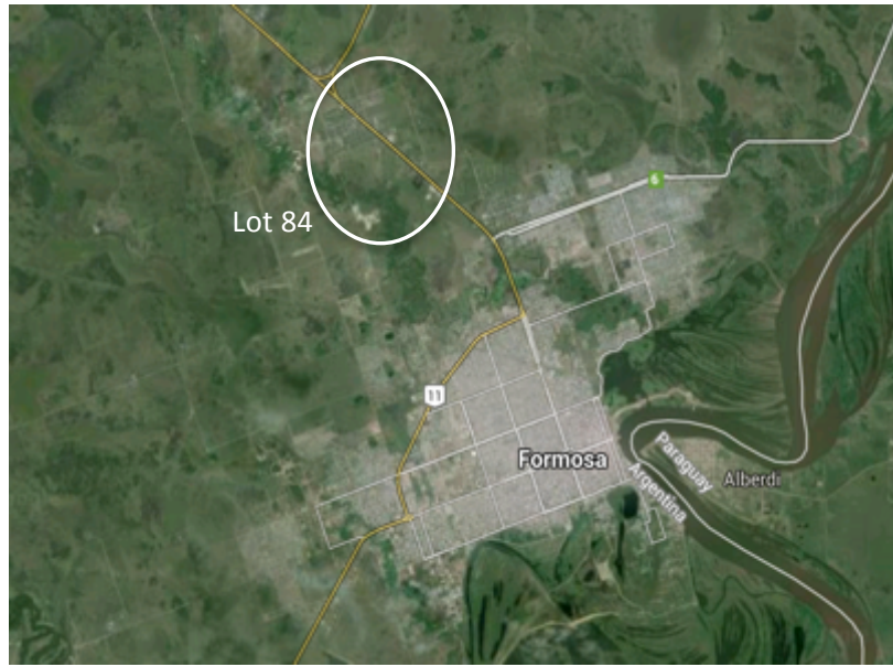
Figure 8: Geographic Separation of Lot 84 from Formosa