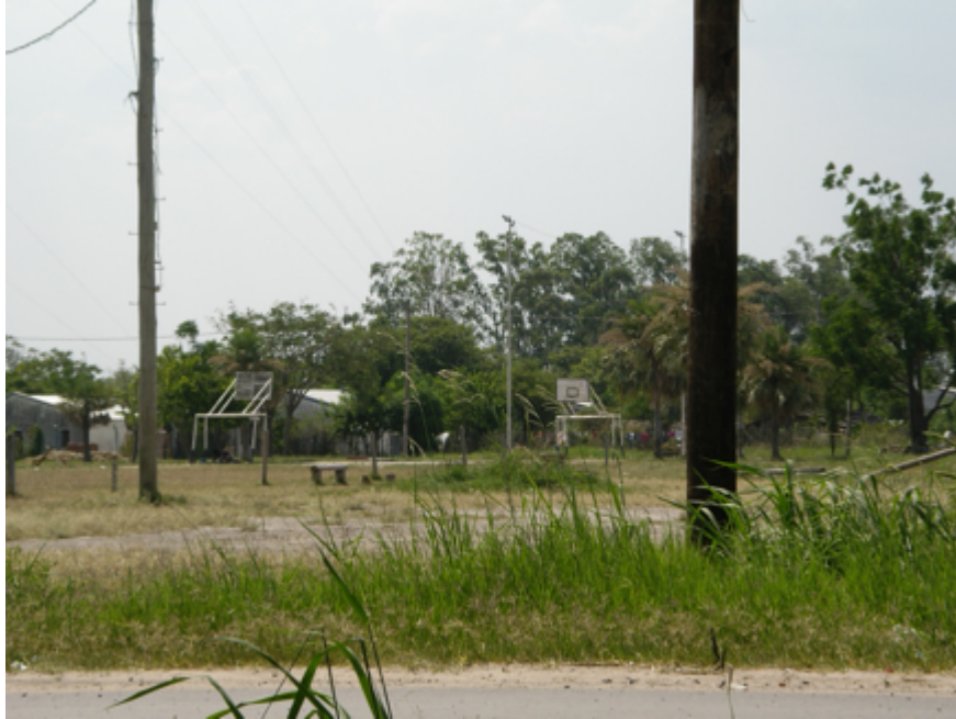
Figure 4: Rugby Fields and Basketball Courts

cross-cutting side streets, residences line the roads in both directions for about a quarter mile.