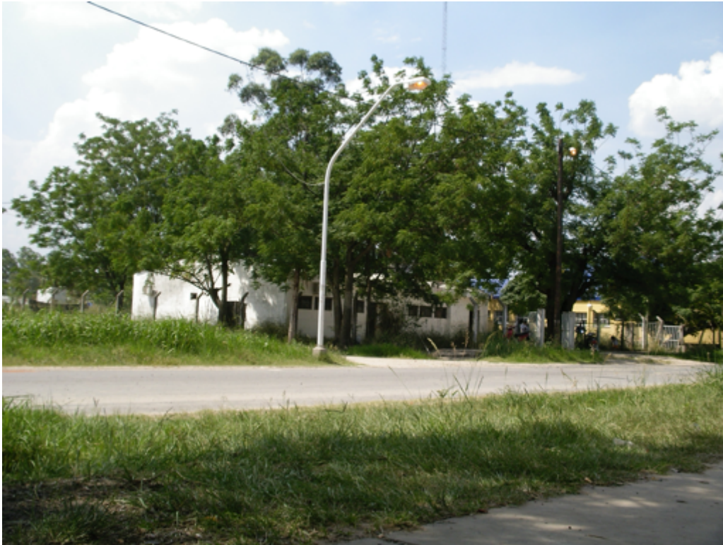
Figure 2: Lot 84 Health Center

( http://www.censo2010.indec.gov.ar/resultadosdefinitivos_totalpais.asp .)