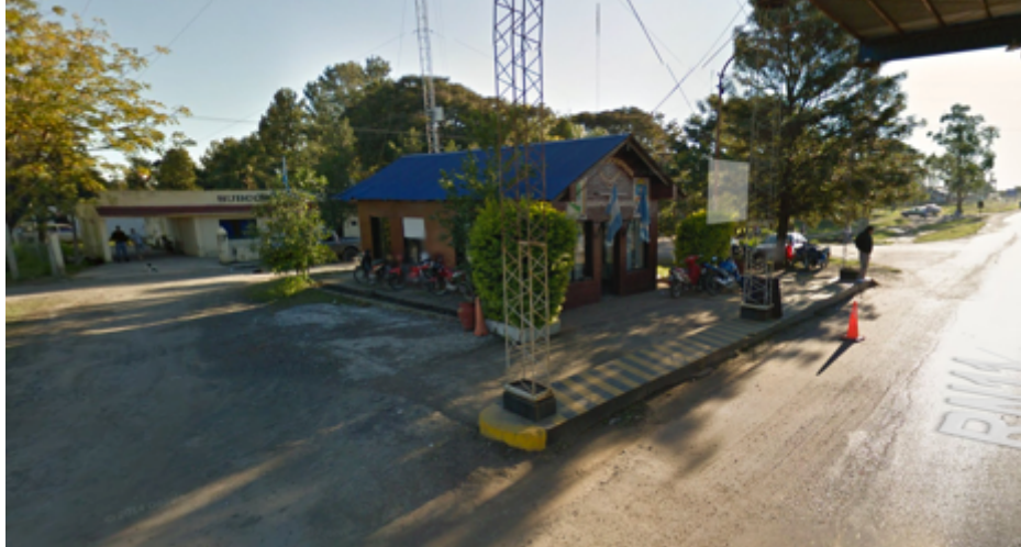
Figure 3: Police Checkpoint

Lot 84 is a diamond shaped neighborhood bisected by provincial route 81. Near the main entrance to the barrio is a small police station which operates a government checkpoint (Route 81 eventually reaches Bolivia and Paraguay as it crosses the Chaco on its west-northwest trajectory. As such, the control is necessary to monitor the flow of goods and people) and also administers to Lot 84. To walk down the central street, completely from one end to the other, takes about 15 minutes and amounts to almost exactly 1 mile. Proceeding southward down the main and only paved road of Lot 84, there is a newer elementary school, an older high school, and a five-room community health center (see Figure 2). Billboards advertise the names of politicians who secured funding for these public works, obras sociales . The walls surrounding the schools are scrawled with graffiti of numerous artists, the work of adolescents who still or had once made a habit of hanging out there. Continuing for the remaining four blocks, one passes a large rugby field (see Figure 4), dilapidated basketball courts, soccer fields, a small kiosk selling cigarettes, candy, junk-food, ice, and alcohol, and two Pentecostal churches (though there are several more nestled throughout the barrio (see Figure 5). Down the