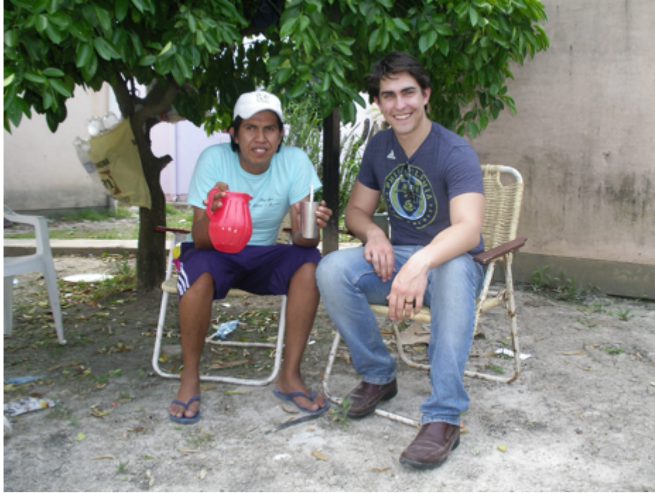
Figure 7: The Author sharing tereré

on the backs of mopeds, on bicycles, and to church cultos . In fact, the majority of my fieldwork was spent drinking tereré or mate with people.