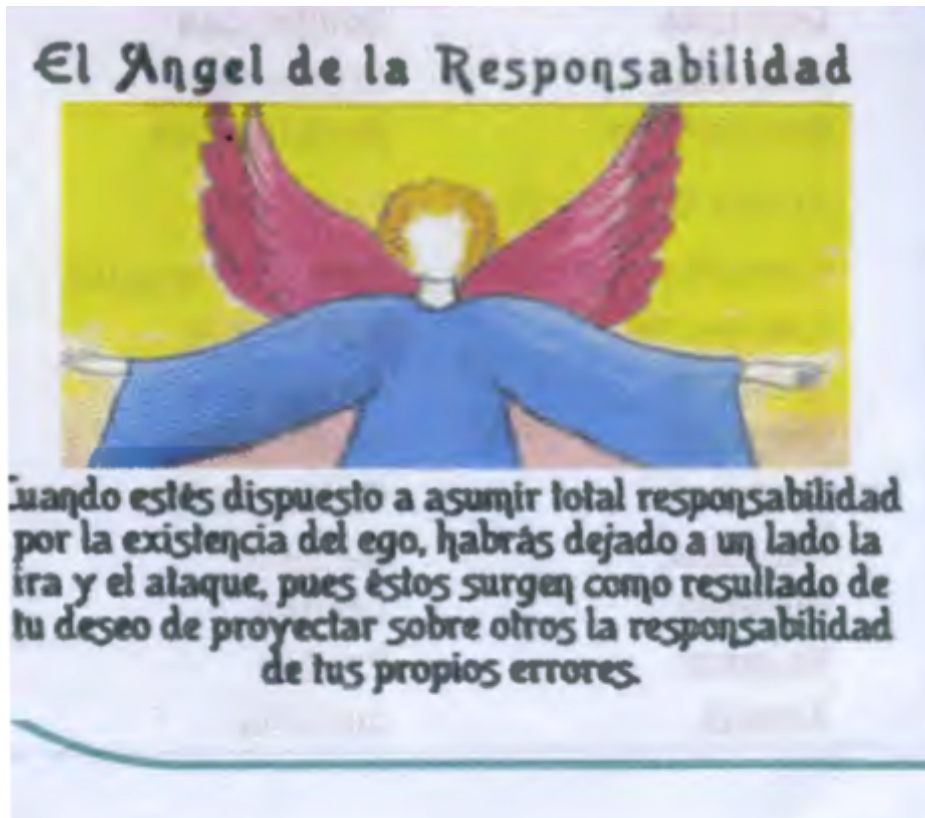
Figure 10: The Angel of Responsibility

Although the police disseminate information to students and the wider public through presentations and pamphlets, these informational materials are not prepared by the police department members but rather psychologists. The Head of the Division of Prevention detailed to me: