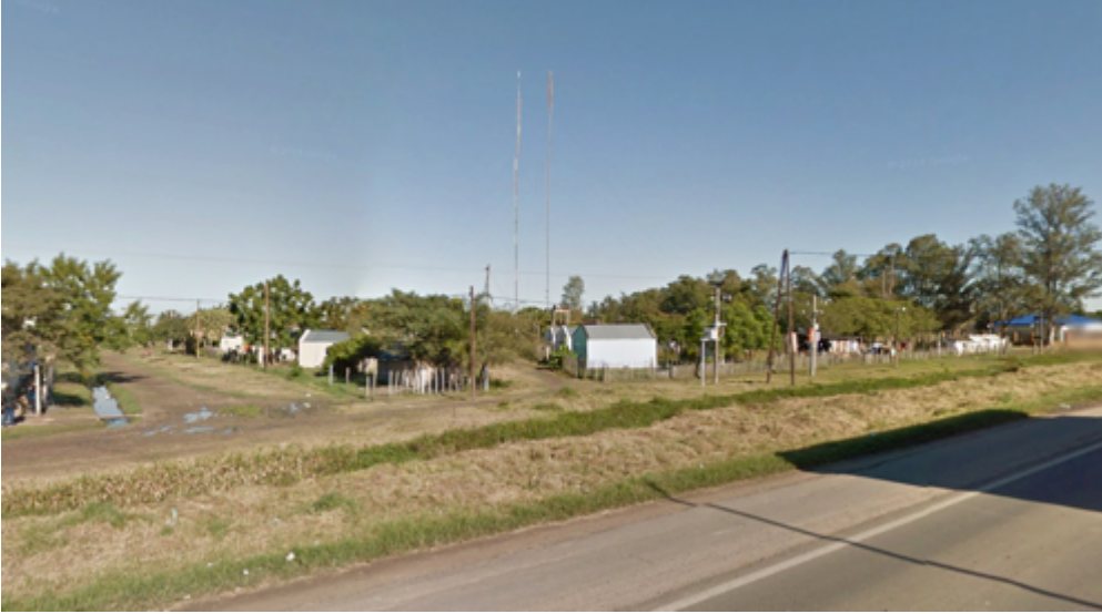
Figure 9: Antenna