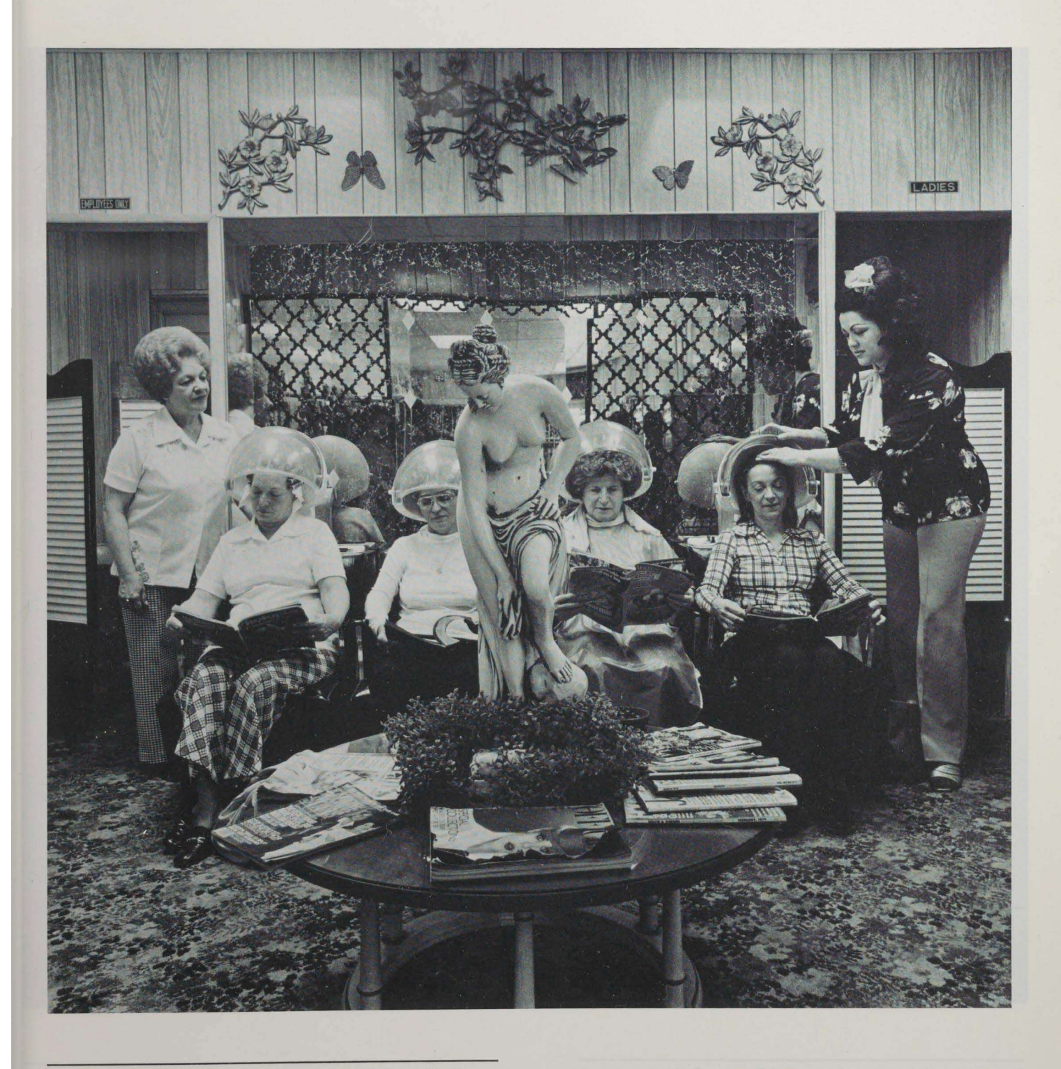
Nan Cotrelle Coiffeurs, a few days before Easter, in Canton.