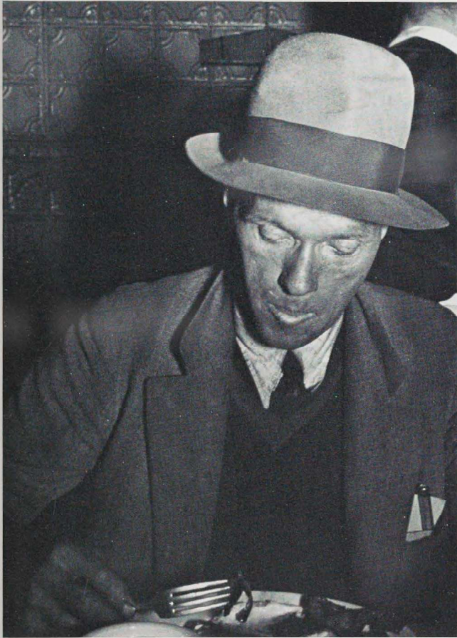
Figure 5 "A New York 'bum,' my friend and guide through the darker side of a splendid city."

"BIZ paid extremely well; I used to get 1500 gold marks for a double page. To give you an idea of the value of 1500 gold marks, the smallest Mercedes car cost about 5500, three-and-a-half times more than I earned for these pages. It means that I was well paid.