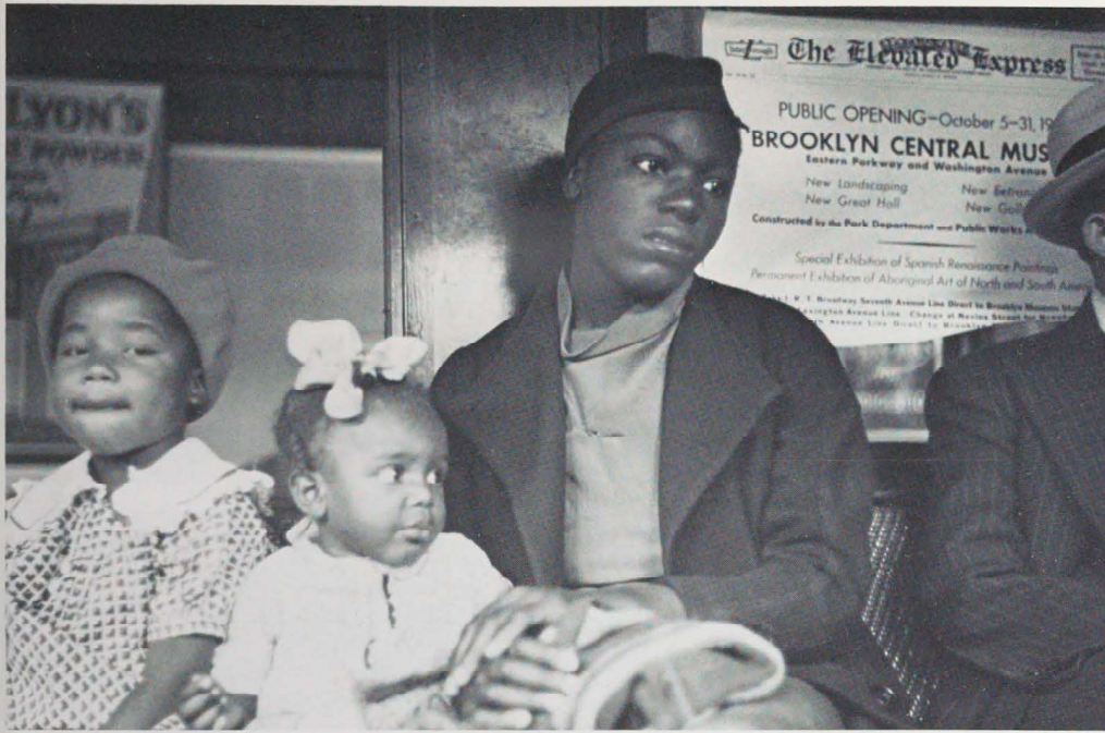
Figure 14 "New York Subway."