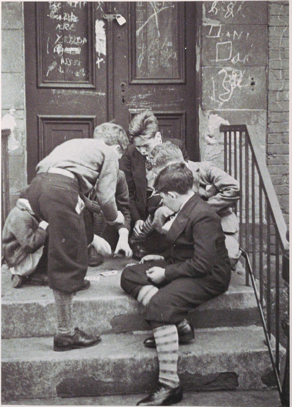
Figure 11 "Gambling Boys, Brooklyn."