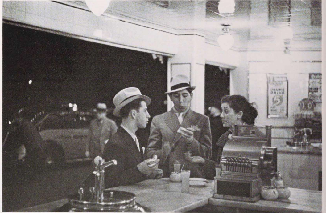
Figure 16 "Greenwich Village, a painter and model." ▶