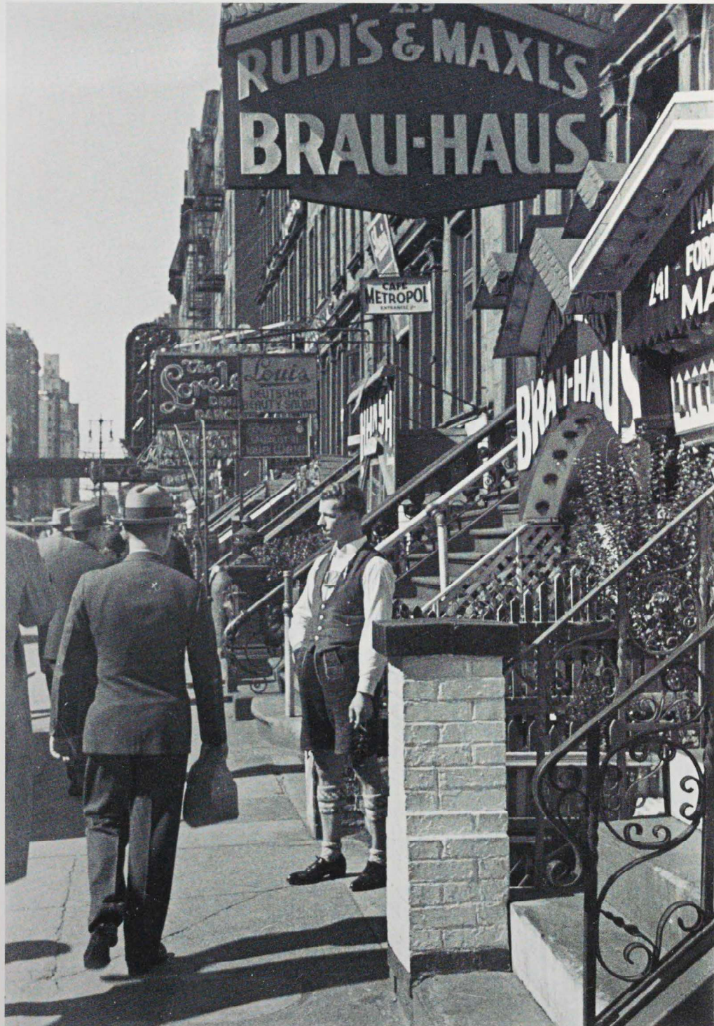
Figure 12 "Germantown, a waiter at the entrance of an imitation 'Brauhaus.'"