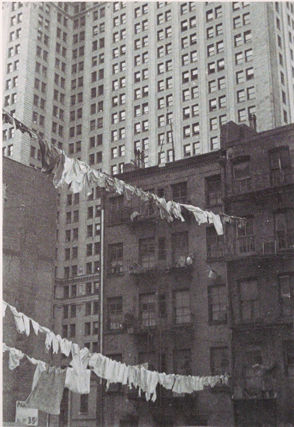
Figure 7 "Typical downtown N.Y. in 1935—expensive buildings and poor quarters side by side."