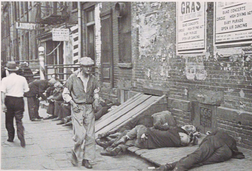
Figure 4 "Drunk and Homeless on the Bowery."