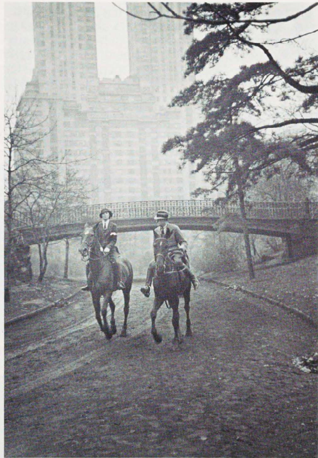
Figure 2 "Central Park, New York."