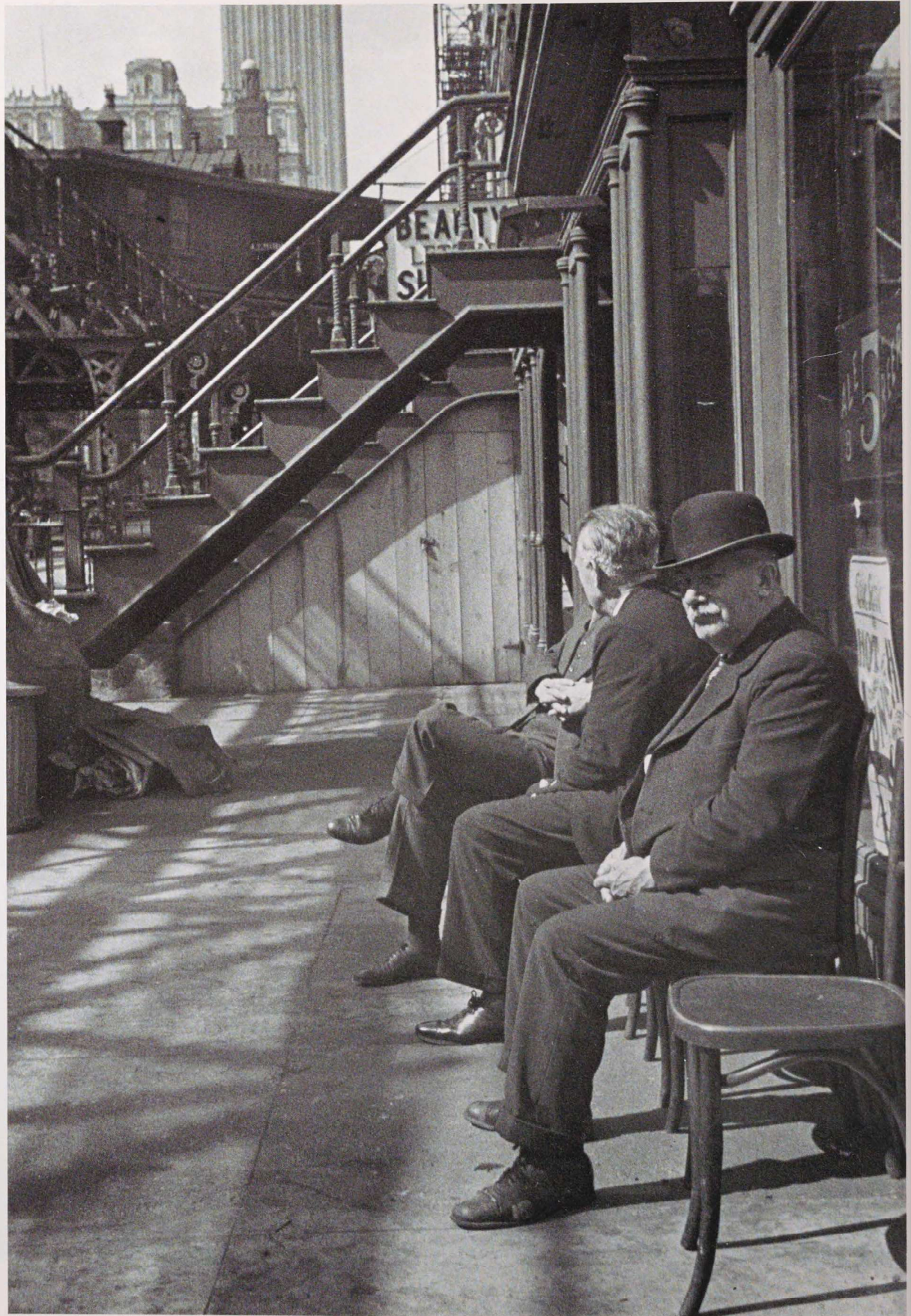
Figure 13 "Sunday in Manhattan."