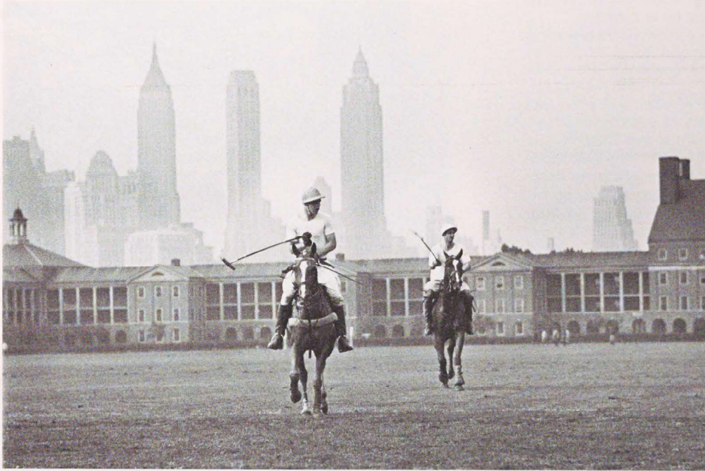
Figure 3 "Polo on Governor's Island against the famous skyline."