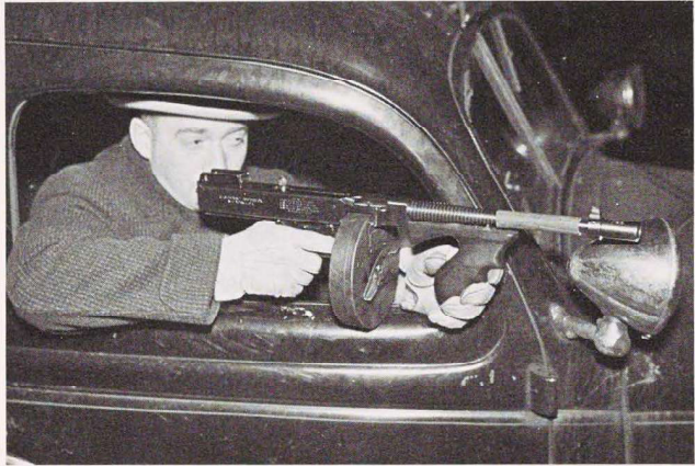
Figure 8 "I had the opportunity to ride at night-time with police squad cars. The detective had a Thompson submachine gun—a weapon also used by Chicago mobsters."