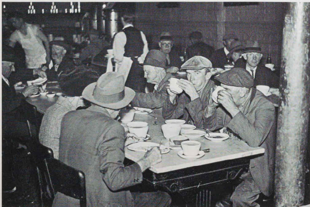
Figure 6 "A restaurant patronized by N.Y. bums. Here you can eat for 25 cents. I have been most candidly invited by these men."

"When this story was finished I went to Washington. I had received an invitation from the people at National Geographic magazine who had seen some of my work. In Washington I did two stories for them. I had spent three summers in the tropics and now I thought I would enjoy a really nice summer, but Washington, D.C., in June was like Hell. It was hot without the palm trees and the roaring tigers. I had time to spare and was roaming through the Senate building, where congressmen have their offices. I enjoyed being there because it was air-conditioned. I took pictures—portraits—of all the important politicians of the time and got written statements about their views of the current situation. These written and signed statements were burned in Berlin, but I still have the pictures, among them the famous Huey Long. He was quite a strange fellow, but I got along with him. Another is a former Vice President of the United States who claimed himself to be an Indian, or his father was an Indian, showing this Calumet to me. I've got about ten portraits of the more important senators and political figures.