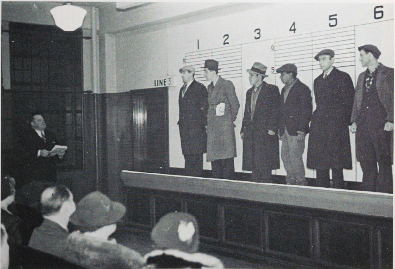
Figure 10 "Lineup at Chicago police headquarters—the police officer (left) telling what is known about the suspected criminals."