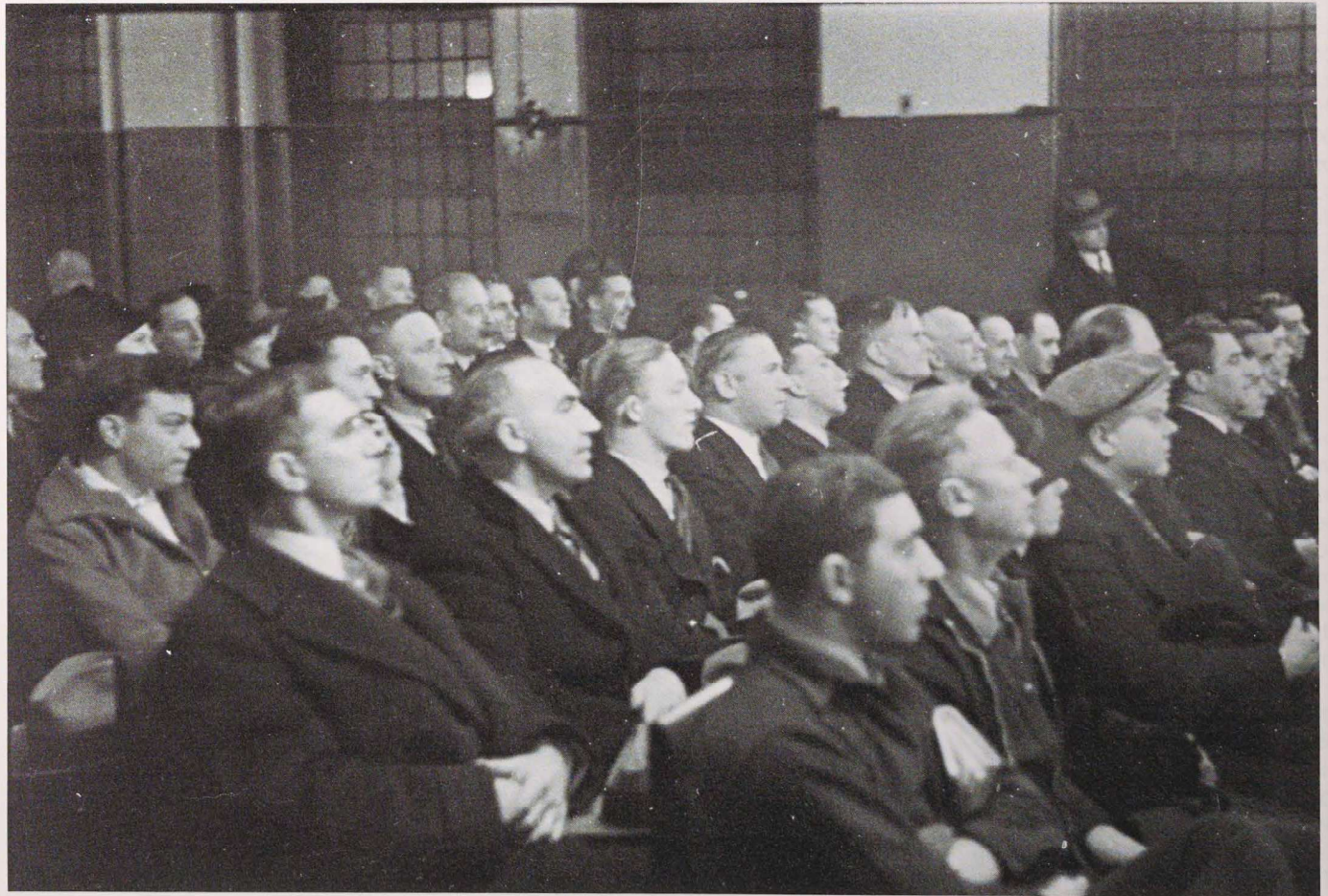
Figure 9 "Present at the lineup; plainclothes policemen, victims, and curious spectators."