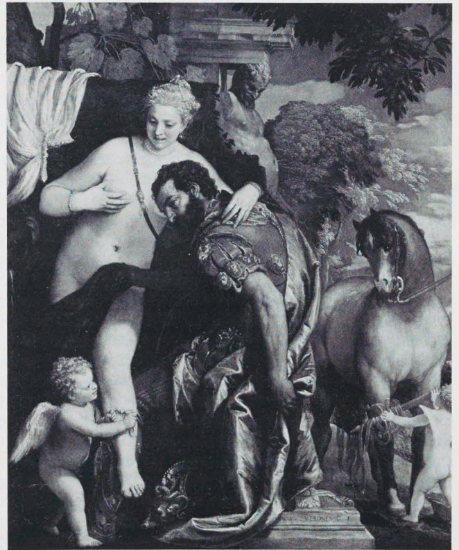
Figure 3 Paolo Veronese. Mars and Venus United by Love (ca. 1576-1584). The Metropolitan Museum of Art, New York.

pinup actually tell us anything about the history of European beliefs about the female nude?