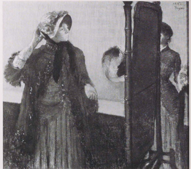
Figure 1 Edgar Degas. At the Milliner's (1882). The Metropolitan Museum of Art, New York.

An immediate problem with this analysis lies in the way Berger produces what he takes to be evidence that this is how, notwithstanding some special exceptions, Western painting has characteristically treated women. Comparing a detail of an Ingres Odalisque with a photograph from a popular magazine or seeing Bronzino's Allegory of Time and Love in a way such that