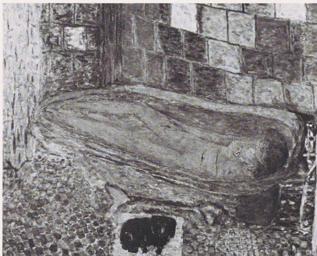
Figure 4 Pierre Bonnard. Nude in Bathtub (ca. 1938-1941). Carnegie Institute, Pittsburgh.