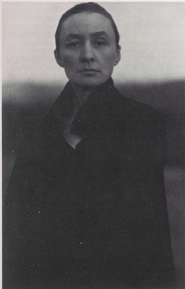
Figure 1 Alfred Stieglitz. "Georgia O'Keeffe," 1920 (?). Gelatin silver print, 8¼ × 5¼ in. National Gallery of Art, Washington, D.C. Alfred Stieglitz Collection, 1980.