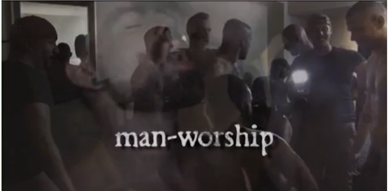
Figure 3: Still from Viral Loads. Dissolve from Figure 2. Actors and crew members alike are shown in the screen as the vehicles of “man-worship.”