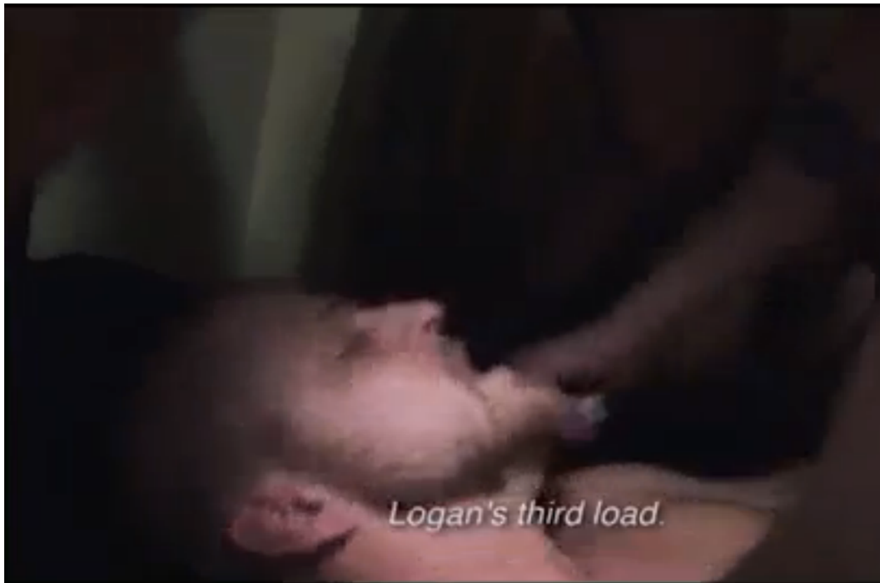
Figure 5: Still from Viral Loads. "Logan's third load" subtitled. The film compensates for its formal constraint of screening orgasm and desire for internal orgasm by subtitling when performers orgasm directly into Bailey's anus.

pornographers to require their male performers to ejaculate outside of an orifice. But this conflicts with bareback pornography's commitment to internal ejaculation. This formal constraint is initially satisfied in Viral Loads by the use of subtitles denoting when an actor has orgasmed (Figure 5), but during a scene where multiple actors have multiple orgasms across long expanse of the scene, the scene still needed the kind of conclusive, final pleasure of the money shot of mainstream hardcore pornography. The jar, which concludes the scene, can be seen to replace this effect.