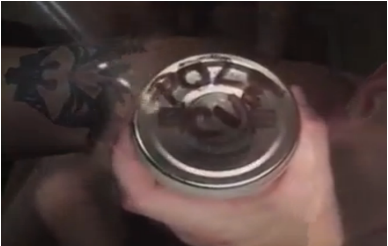
Figure 6: Still from Viral Loads. The jar’s label is shown directly to the camera before

theorist Susanna Paasonen, Morris has said that “the information that’s transmitted through queer sex involves the creation of the self, but not in a way that’s chemically or molecularly genetic.... Queers replicate through social, sexual, and creative promiscuity. We don’t reproduce, we replicate.” 37 This helps us understand why the jar is necessary: the jar is the site and embodiment of the replication of queerness. With the words “POZ CUM” dully marked against a shining gold lid, the jar is labeled with its own symbolic weight. Its “radioactive” meaning is emphasized by its being shown to the camera, zoomed in on, examined (Figure 6). The jar is erotic because it holds both risk and promise, a future built on a re-examination of death.