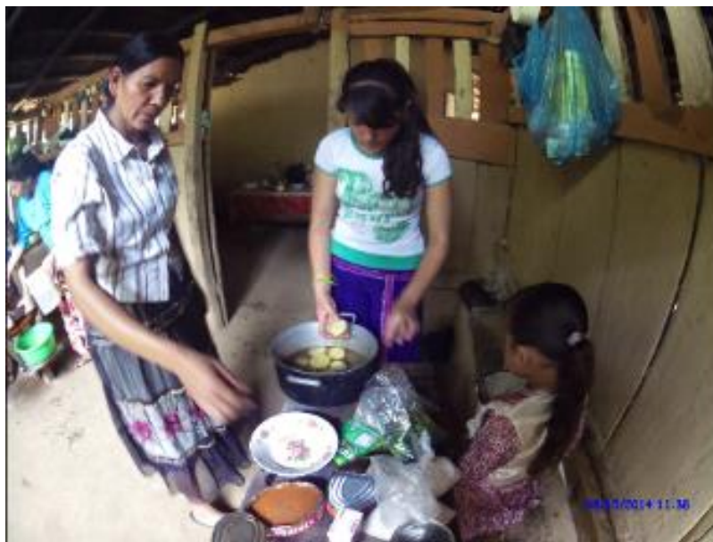
Figure 1 (Above): Mother oversees eldest daughter preparing potatoes as youngest watches/learns.