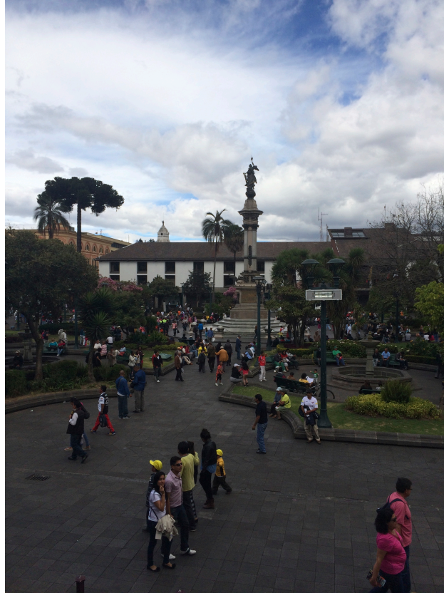
Figure 3: Plaza Mayor, Quito, Ecuador. The statue at the center memorializes independence from the Spanish and is modeled after the US Statue of Liberty. 5

Ecuador's Indigenous people are distributed across the geographic regions but often have similar issues in terms of access to services and economic opportunities, and may share linguistic roots and histories. The differences between these groups, though sometimes subtle, are crucial, especially when considering organization and strategy. Depending on their location, Indigenous groups may have centuries of experiences laboring on land they do not own or may have very minimal contact with the outside world. Either scenario would inform both organizational and content goals for education.