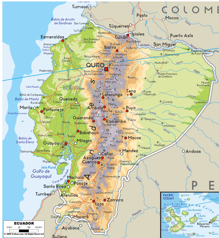
Figure 1: Physical map of Ecuador 3

Economically, Ecuador is largely dependent on oil but tourism represents a growing industry. The largest exports have not changed in decades: petroleum and bananas, though other agricultural products, including cacao and coffee, are also exported. Foreign debt and economic intervention has created a longstanding dependency problem, currently the biggest foreign investor is China and a series of world class malls recently opened in Quito, all funded by the Chinese, featuring international chains such as Dunkin' Donuts and Zara. These malls are nearly identical to their North American counterparts. The role of foreign investment, particularly when connected to resource