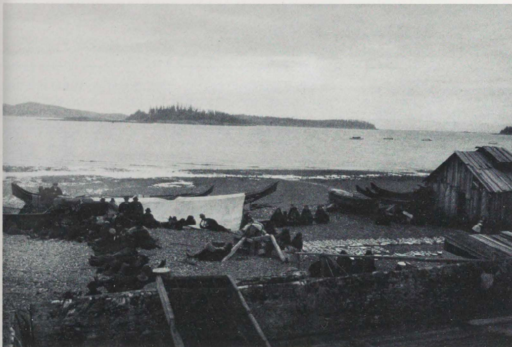
Figure 20 Trade goods at a potlatch. Kwakiutl. Fort Rupert, B.C. Spring, 1915. Samuel A. Barrett, photographer. Milwaukee Public Museum, no. 3659.