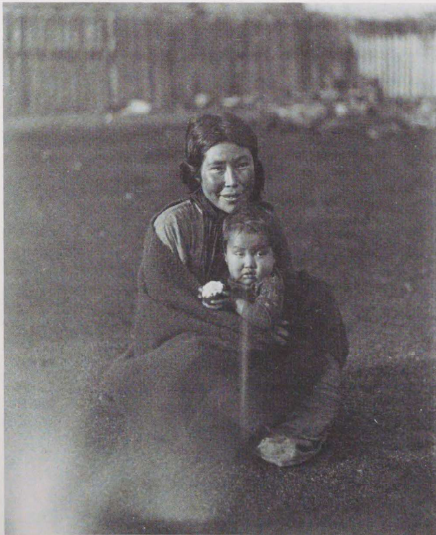
Figure 8 Portrait: Nakwoktak mother and child. Fort Rupert, B.C. November 26–27, 1894. Oregon C. Hastings, photographer. American Museum of Natural History, no. 336099.

All the portraits were taken outdoors, most against a side of a house or in front of a nearby fence. In several of these a white blanket has been tacked up behind the subjects. Thus, the setting is relatively or completely neutral, emphasizing the subject. In this case, there is no metonymic link between person and surroundings. The clothing worn in these portraits is an accurate reflection of what the Kwakiutl were wearing at the time. Cedar bark and skins had given way to white-manufactured trousers and skirts, with the ever-present trade blanket. On top of this everyday garb, most in the portraits also wear ceremonial clothing—button blankets and cedar bark head and neck rings. Although indeed these items were more colorful, more “Indian,” Boas and Hastings were photographing in the midst of the ceremonial season, and this was what people were wearing as they went from dance to feast to potlatch. Similarly, many hold items of ceremonial significance—coppers, staffs, spears—which help establish their native identity to a white audience and their high rank to a native one.