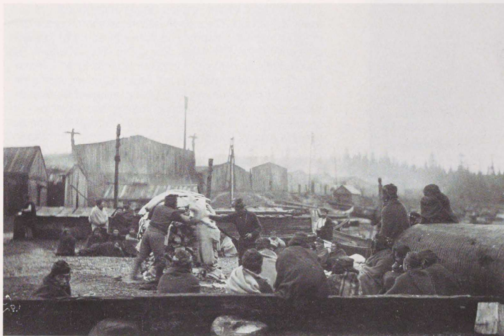
Figure 13 Koskimo copper purchase ceremony, from the East. Fort Rupert, B.C. November 25, 1894. Oregon C. Hastings, photographer. American Museum of Natural History, no. 336066. Published in Boas 1897a:pl. 8.