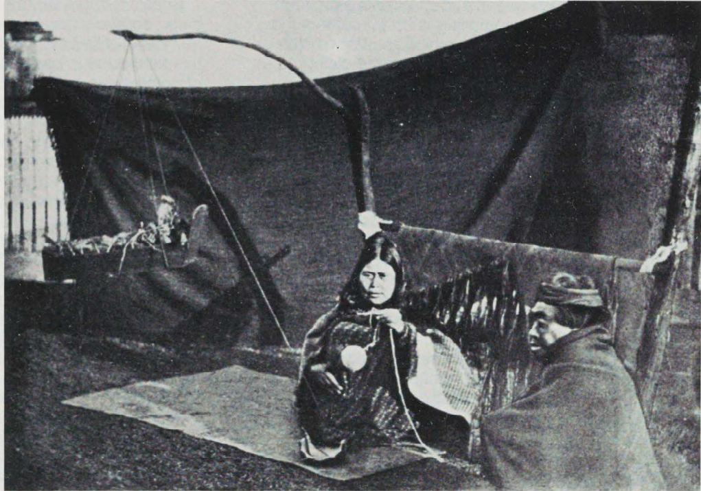
Figure 27 Woman spinning, Hastings photograph as reproduced in retouched version in Boas 1909:pl. 27-bottom. Notice absence of Franz Boas and George Hunt holding up blanket.

The set of plates following the text is discussed nowhere in the text yet is preceded by a list of illustrations giving tribal group, length, catalog number, and references to the text. The reason for this is that the material Boas had on hand from the Jesup Expedition exceeded the space allotted to him by the Museum's administration. The plates already having been made, Boas decided to publish them as is, with the intention of discussing them in a future volume, which unfortunately was never published. 46