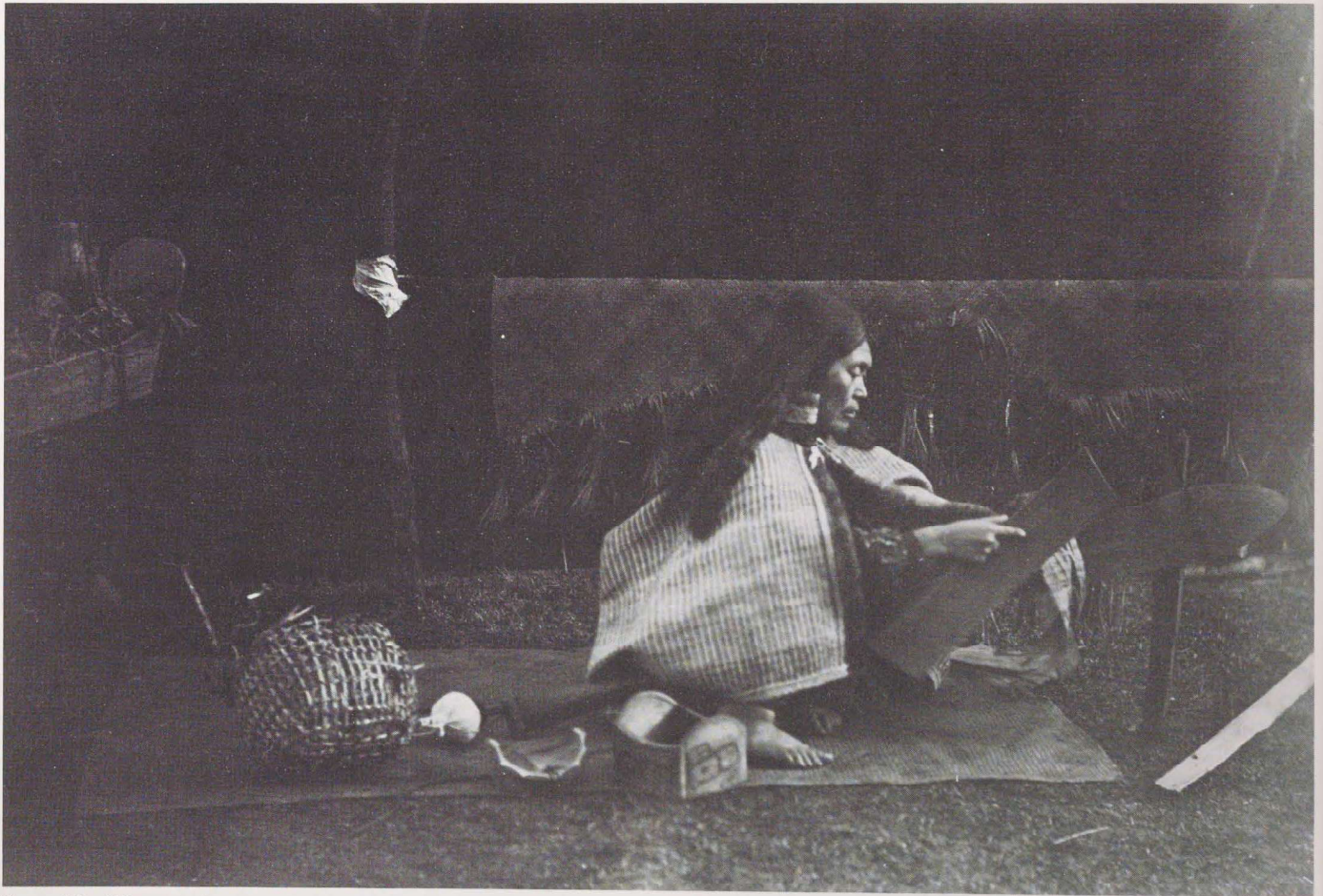
Figure 22 Woman shredding cedar bark; field photograph used as a model for museum exhibit. Kwakiutl. Fort Rupert, B.C. November 30, 1894. Oregon C. Hastings, photographer. American Museum of Natural History, no. 11611. Published in Boas 1909:pl. 27-top.