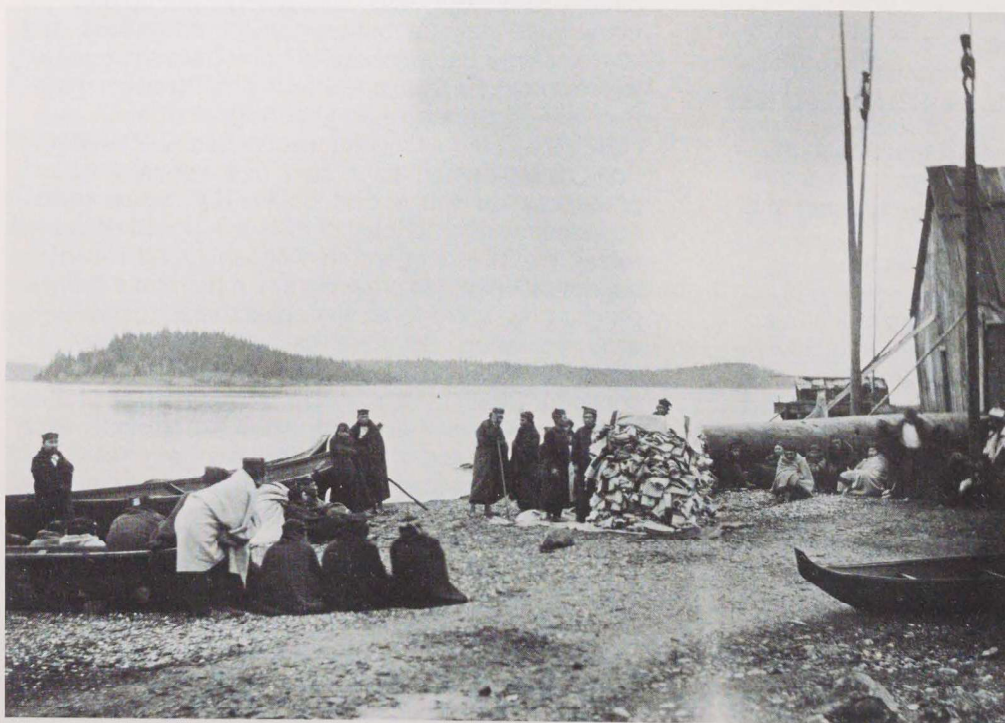
Figure 14 Koskimo copper purchase ceremony, from the West. Fort Rupert, B.C. November 25, 1894. Oregon C. Hastings, photographer. American Museum of Natural History, no. 127061.