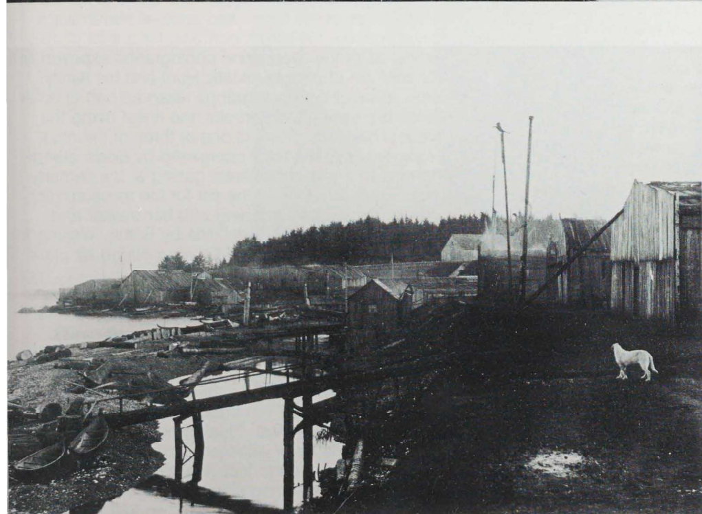
Figure 5 Village scene, from the West. Fort Rupert, B.C. November 26, 1894. Oregon C. Hastings, photographer. American Museum of Natural History, no. 336060.