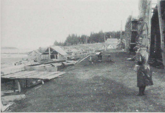
Figure 1 Street scene, with Julia Averkieva taking a photograph, at the side. Fort Rupert, B.C. October 1930–January 1931. Franz Boas, photographer. American Museum of Natural History, Photography Accession no. 157.