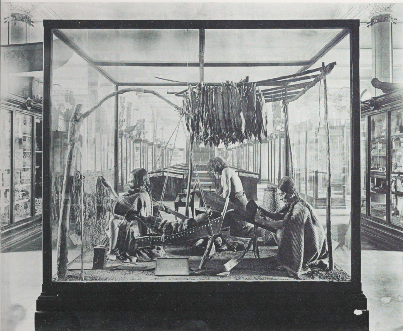
Figure 23 Life-group exhibit: "the uses of cedar." Northwest Coast Indian Hall, American Museum of Natural History, New York. Ca. 1904. Photographer unknown. American Museum of Natural History, no. 384.