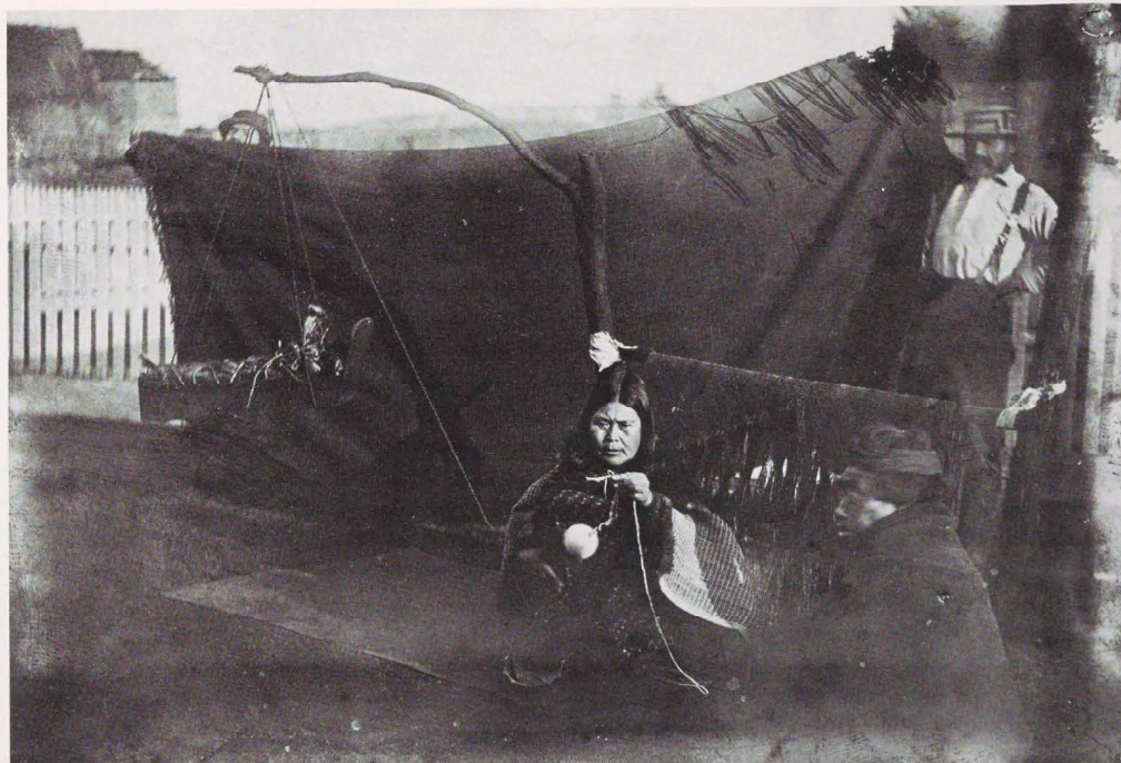
Figure 26 Woman spinning. Kwakiutl. Fort Rupert, B.C. November 30, 1894. Oregon C. Hastings, photographer. American Museum of Natural History, no. 11608.

We are also confused by Boas's identification of the photographer. In the preface he mentions only Hastings. By leaving out Grabill's name, he also hid the fact that several photographs were taken at the Chicago Fair, a fact that we could not learn from inspection of the retouched pictures.