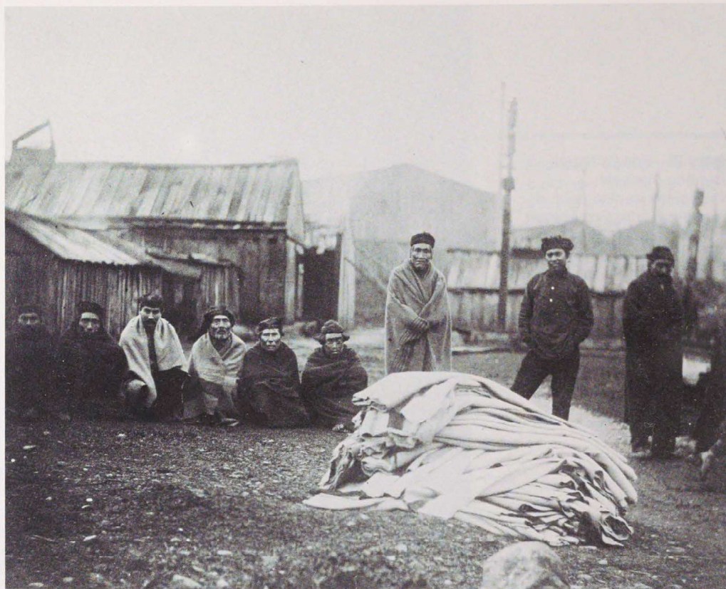
Figure 16 Boas's feast: chief (Nakwotak?) with blankets, Nakwotak seated behind; from the East. Fort Rupert, B.C. November 28, 1894. no. 336114.