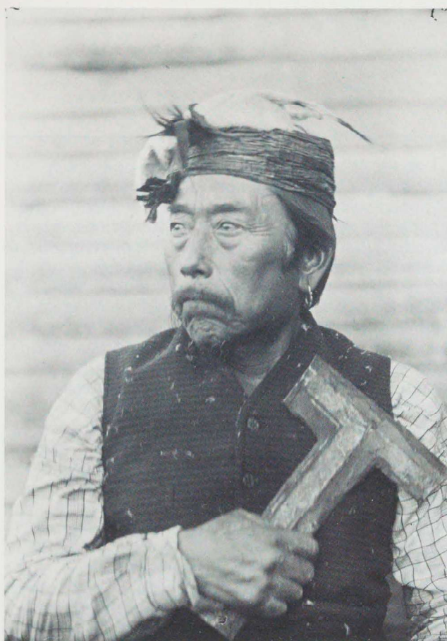
Figure 11 Three-quarters view of physical type set. Nakwohtak man, Yá'qeloagyilis. Fort Rupert, B.C. November 26-27, 1894. no. 11579.

with measurements when possible, but encountered native resistance (Hallowell 1960:70). So often compared to police mugshots, in many cases physical type photographs were mug shots, taken of natives held in prisons. Boas often commented on the resistance of natives to his calipers and found many of his subjects in the Victoria jail. 28 Boas's relatively minor use of the genre on his earlier trips grew to substantial proportions in 1894, leading to an even greater emphasis on the Jesup Expedition. 29