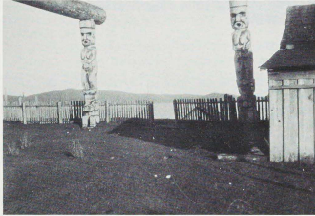
Figure 2 Ruins of interior house posts. Fort Rupert, B.C. October 1930–January 1931.