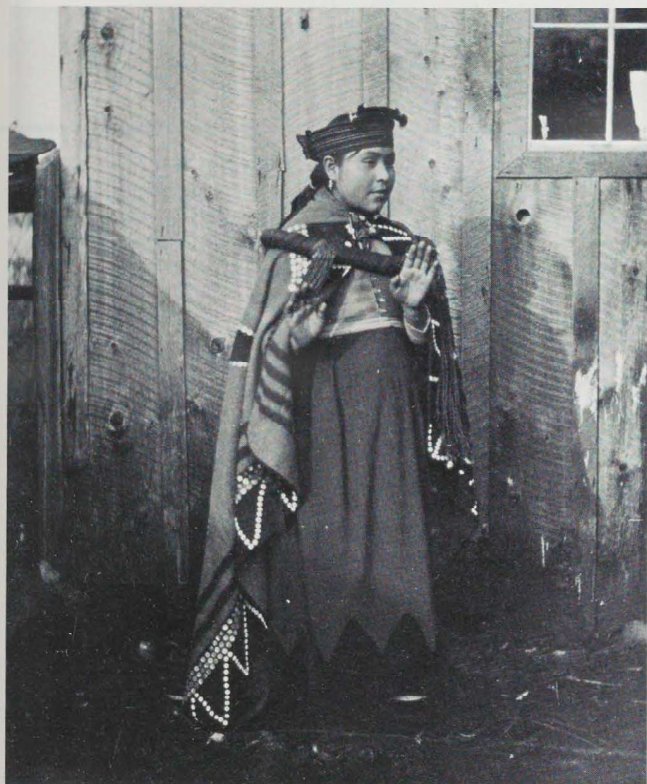
Figure 12 Female dancer, posed. Kwakiutl. Fort Rupert, B.C. November 30–December 3, 1894. Oregon C. Hastings, photographer. American Museum of Natural History, no. 336131.

masked and not. While the masked dancers photographed by Boas and Hastings are posed, the series on the return of the hamatsa does show ritualized and expressive gestures.