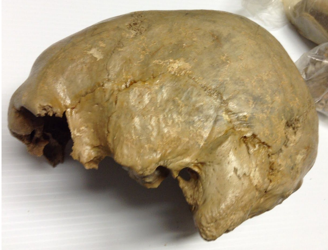
Figure 3: Large mastoid process of object number 33-16-023, a male