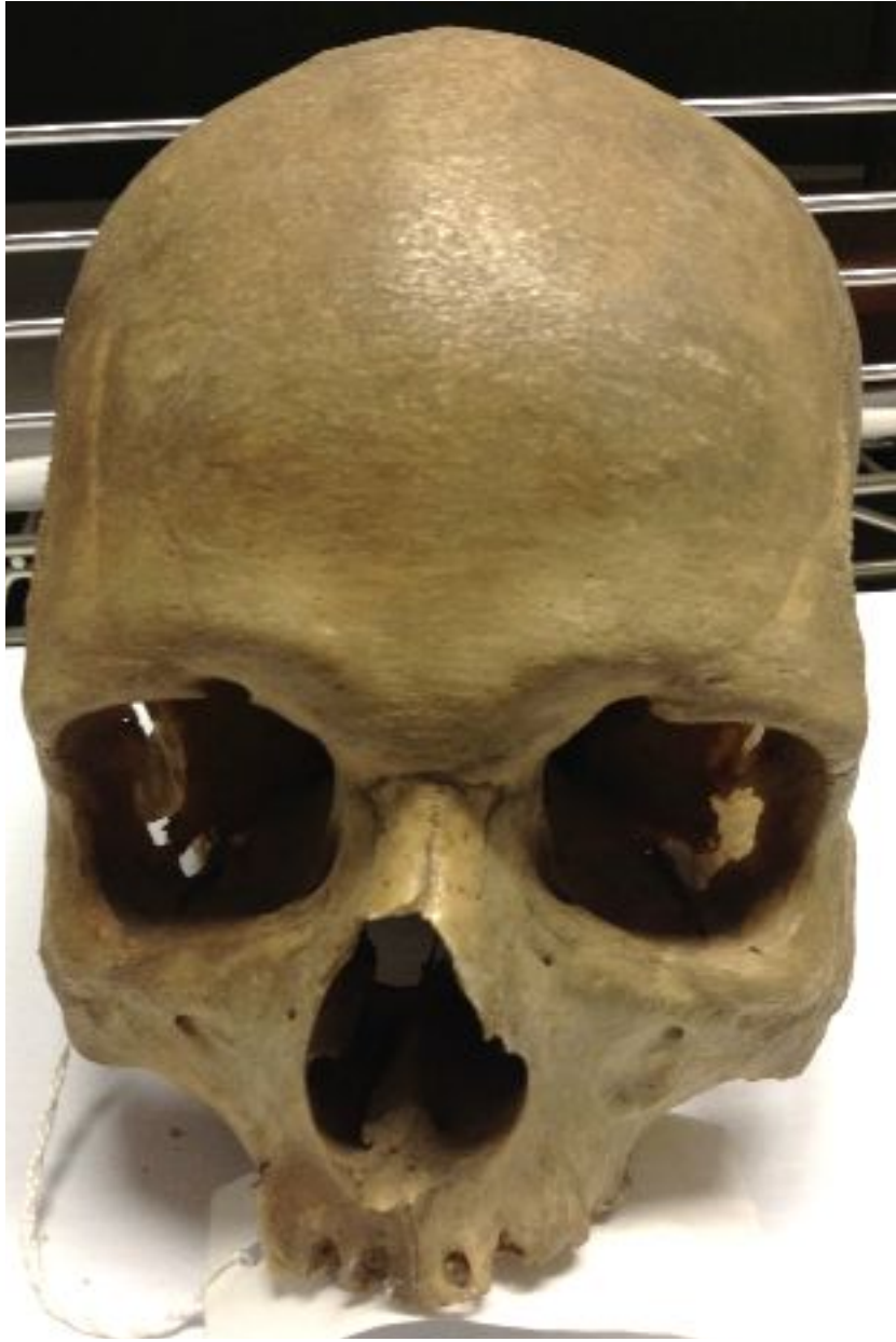
Figure 12: Object number 33-16-143, appears very obviously male, but is actually female, facial view. Notice the prominent supraorbital margin, very square eye orbits, and clearly blunt supraorbital margins.