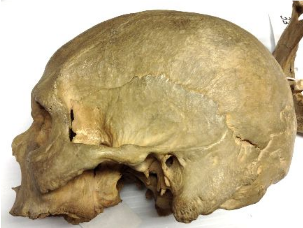
Figure 13: Object number 33-16-143, appears very obviously male, but is actually female, left side view. Observe the protruding mastoid processes, the very slanted forehead, and overall robusticity.