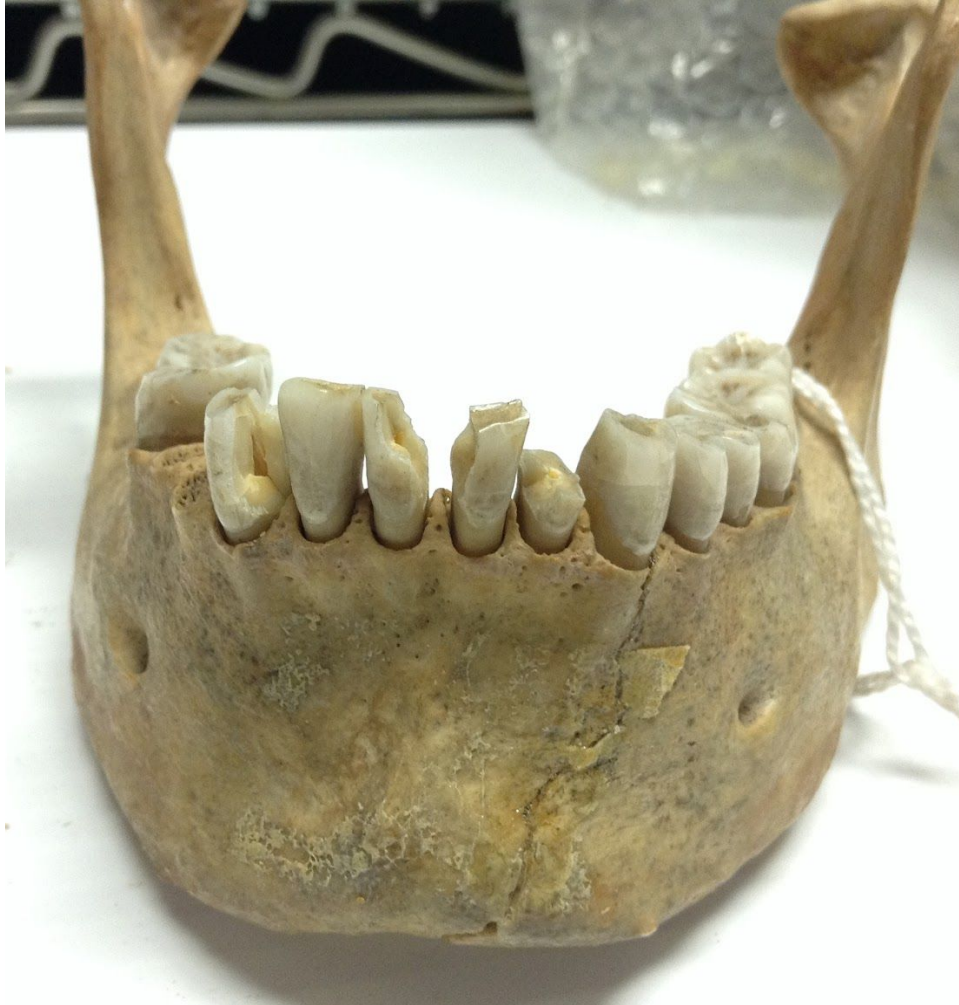
Figure 11: Wide mandibular body of object number 33-16-093, a female.