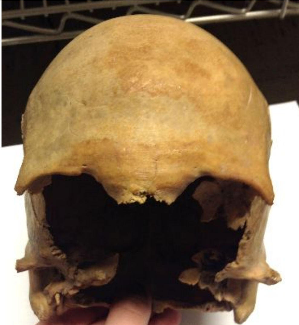
Figure 4: Object number 33-16-110, a female skull with the normal supraorbital ridge expected for a female.