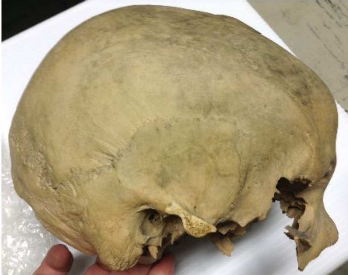
Figure 2: Small mastoid process of female, 33-16-050