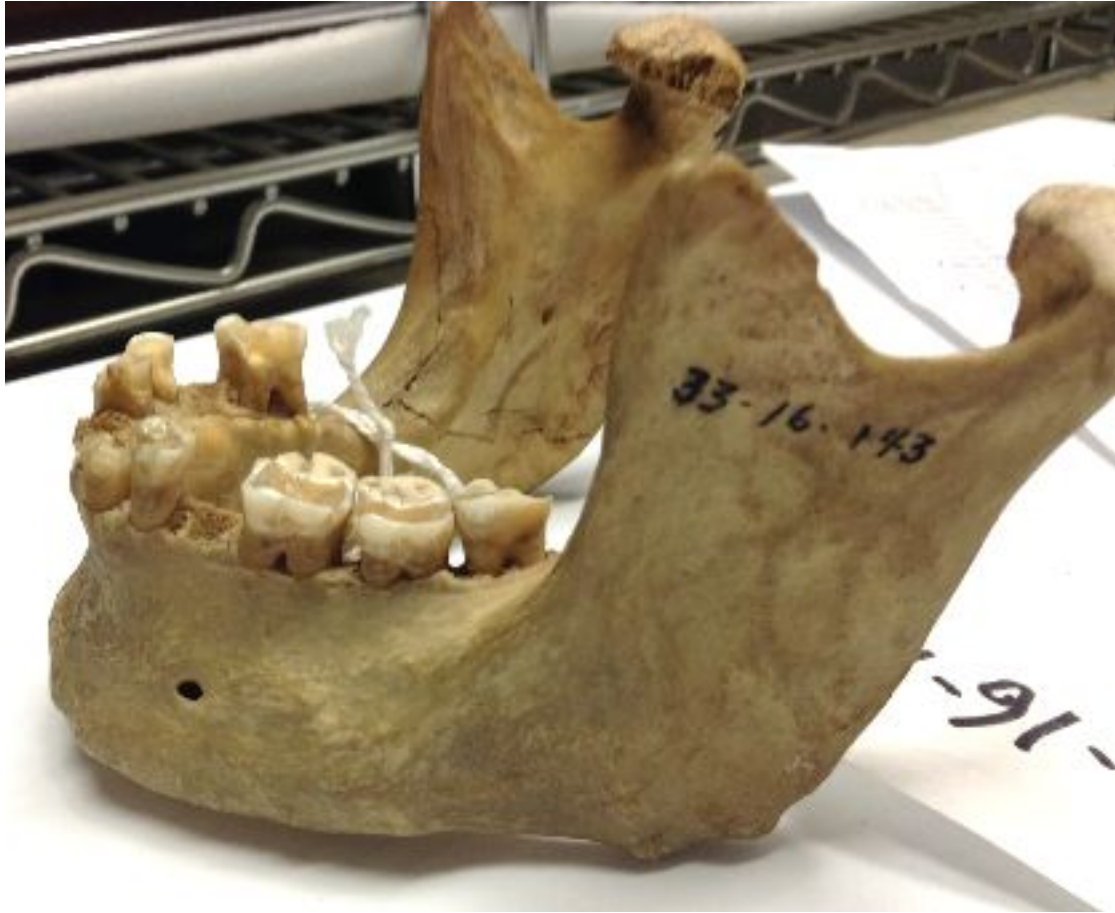
Figure 15: Object number 33-16-143, appears very obviously male, but is actually female. This view of the mandible shows the protubing mental eminence and its overall robusticity.