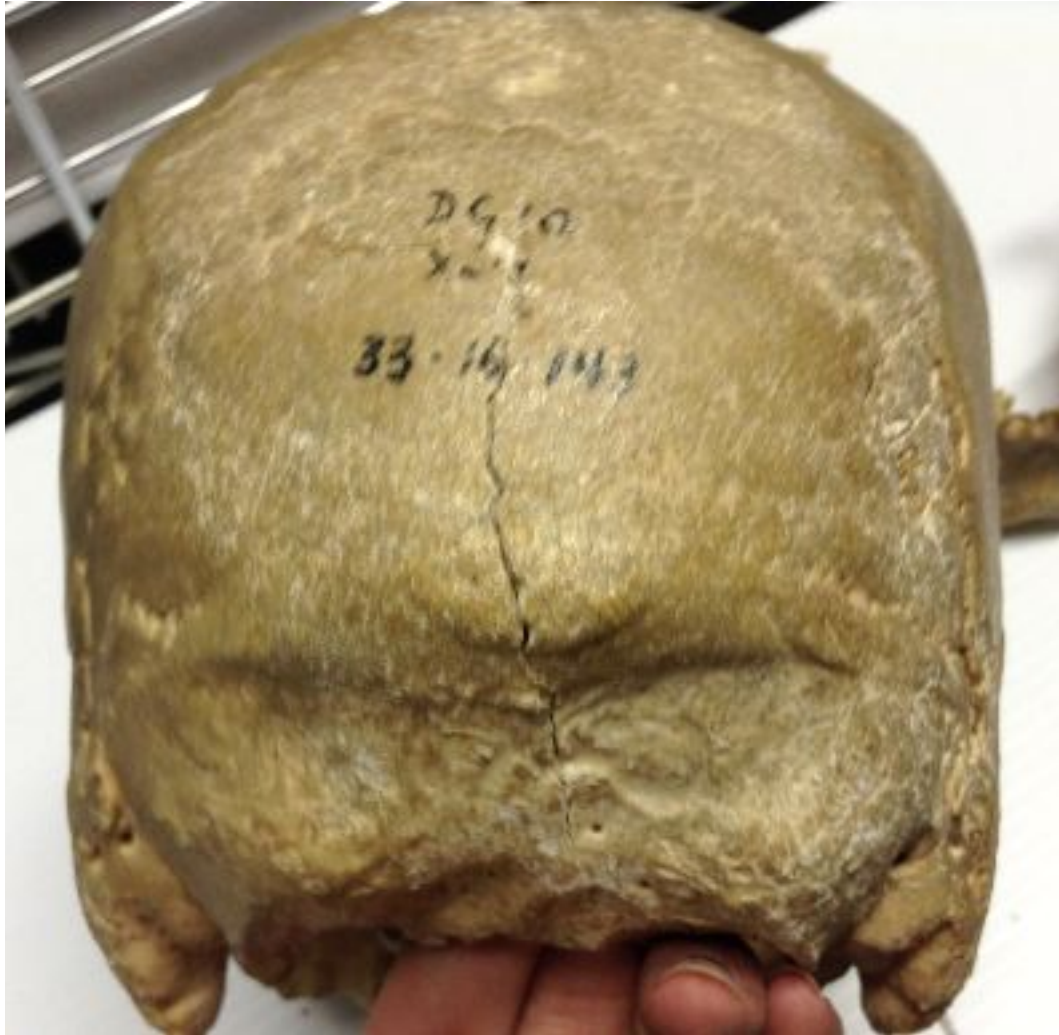
Figure 14: Object number 33-16-143, appears very obviously male, but is actually female. Notice the insanely large nuchal crest and again the prominence of the mastoid processes of this occipital view.