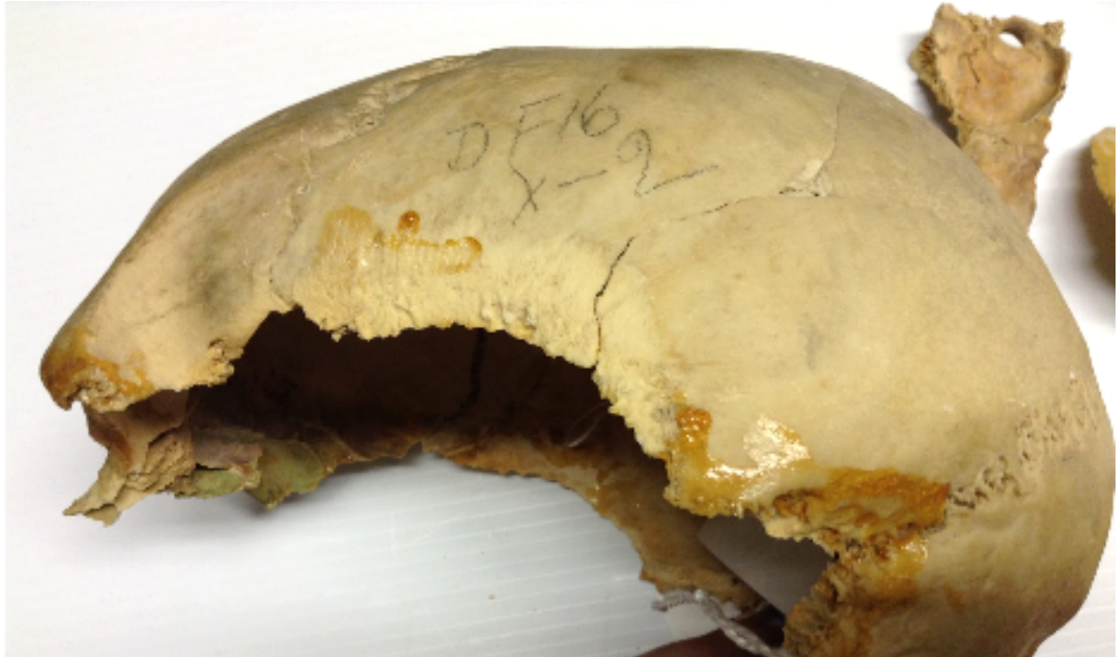
Figure 10: Object number 33-23-124, an excellent example of the sloping forehead of a male