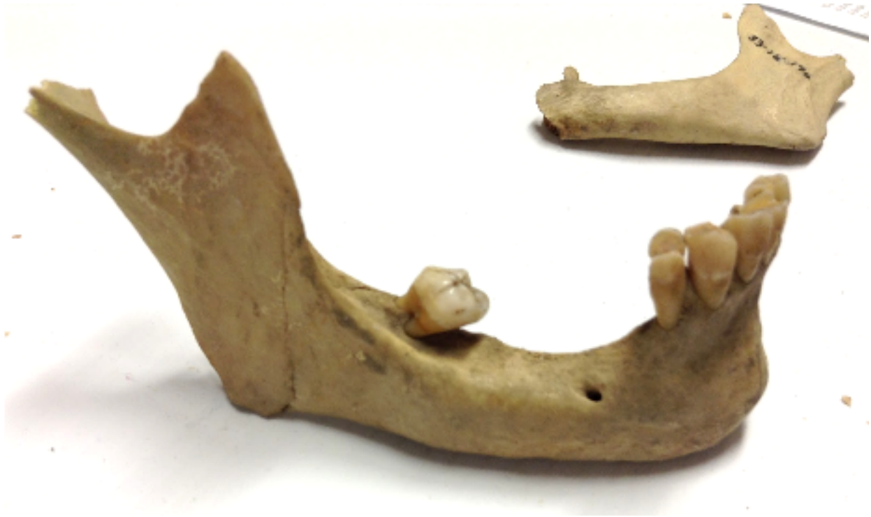
Figure 8: Missing teeth of object 33-16-196 lead me to believe it could belong to an older female.