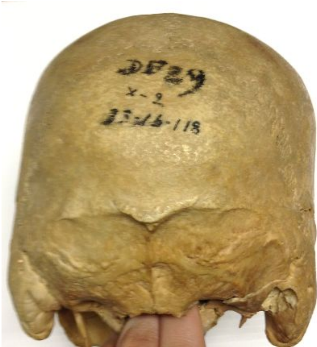
Figure 7: Object number 33-16-118, a male with a less developed nuchal area than in Figure 6.