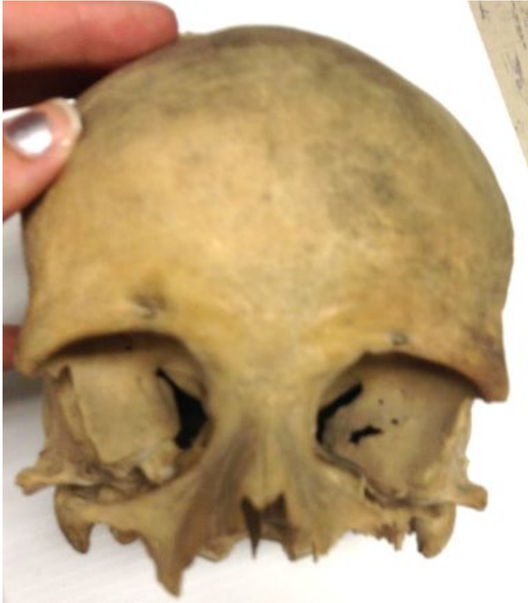
Figure 9: Object number 33-16-050, showing the rounded eye orbits of the typical female skull.