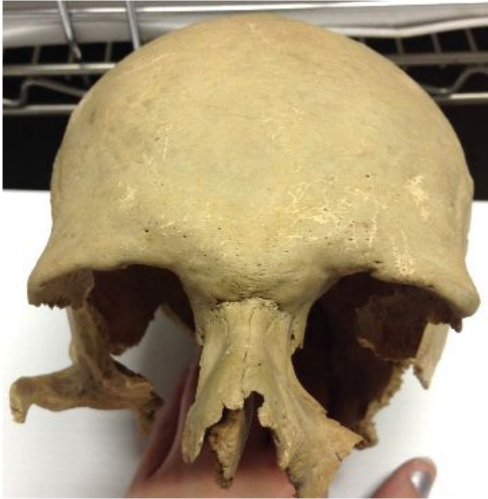
Figure 5: Object number 33-16-093, also a female skull with rather large supraorbital margins.