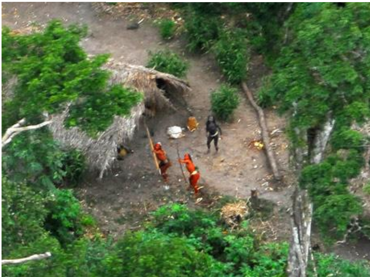
Figure 3: “Photo of uncontacted tribe.” National Geographic , July 5, 2011. http://news.nationalgeographic.com/news/2011/07/pictures/110705-uncontacted-tribe-confirmed-science-world-indians-amazon-rainforest/