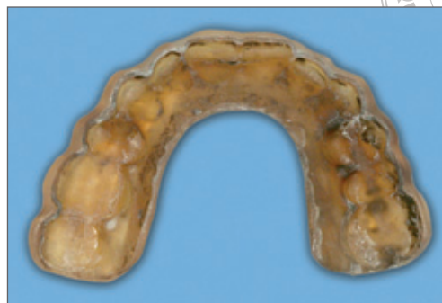
Fig 2 Heavily stained acrylic maxillary occlusal appliance.