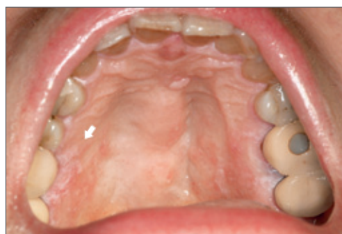
Fig 4 Continued resolution of palatal lesions on 6 week reevaluation. The only remaining area of striae and mild erythema is noted on the vertical portion of the right palate (arrow).

Physical examination revealed a well-nourished woman in no apparent distress. Extraoral examination did not reveal lymphadenopathy, thyromegaly, salivary gland enlargement, or cutaneous lesions. Intraoral examination revealed a diffuse area of striae with erythema primarily on the palate (Fig 1).