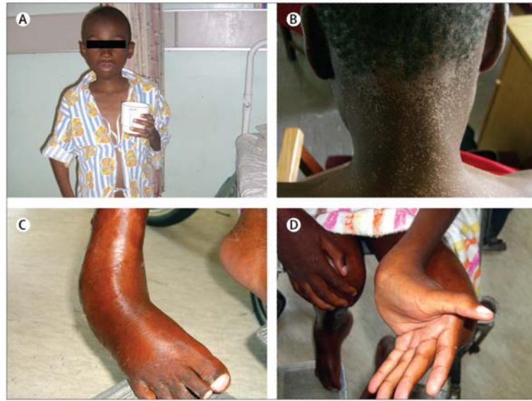
Figure 2. Clinical manifestations of HIV infection in adolescents infected by perinatal transmission

(A) Severe stunting in a 14-year-old boy (height-for-age Z score -3.5 ). (B) Diffuse planar warts in a 13-year-old boy. (C, D) Deforming, non-infectious, seronegative arthritis in a 16-year-old boy. All patients and their guardians have provided their consent for pictures to be reproduced.