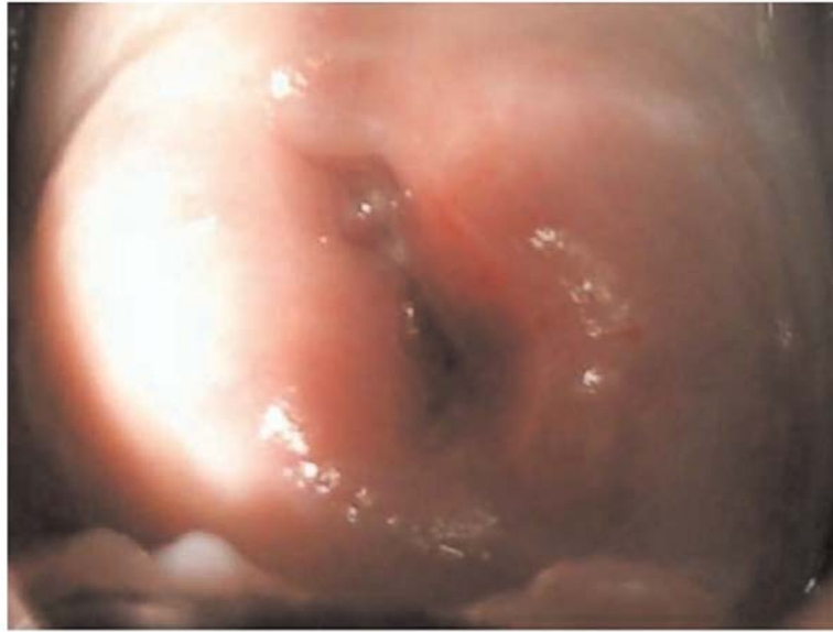
Figure 2. Glare during image capture, causing the camera's focus to fall on the brightest area, and resulting in the cervix falling out of focus