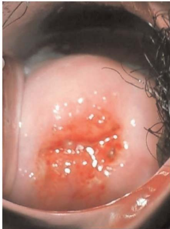
Figure 4. Hair protruding into the field of view between camera and cervix redirected the camera's focus away from the cervix