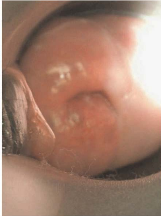
Figure 3. Sections of vaginal wall protruding into the view between camera and cervix redirected the camera's focus away from the cervix