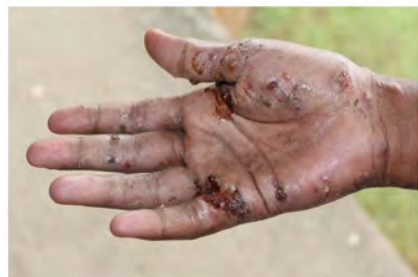
Figure 2. Hand of an adolescent girl in Fiji, demonstrating scabies infestation with typical secondary bacterial infection. doi:10.1371/journal.pntd.0002167.g002

We contend that global control of scabies is achievable, despite a number of impediments. Initial priorities include: i) raising awareness of scabies and engaging